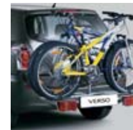
Rear bicycle holder