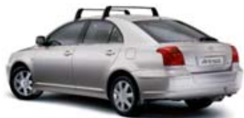
The Avensis is fitted with Pallas 16" alloy wheels, front and rear mud flaps, fixed tow bar and roof rack.