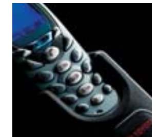
Toyota Hands free telephone kit