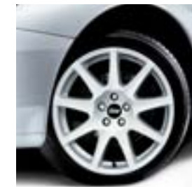
Grand Prix 17" alloy wheels