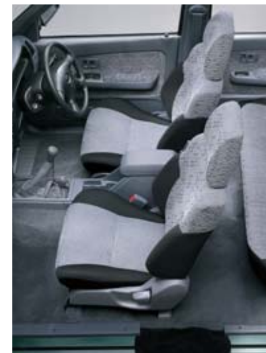
VX interior shown

250 EX Single Cab 102 bhp 280 EX Double Cab 102 bhp 280 VX Double Cab 102 bhp Invincible 102 bhp