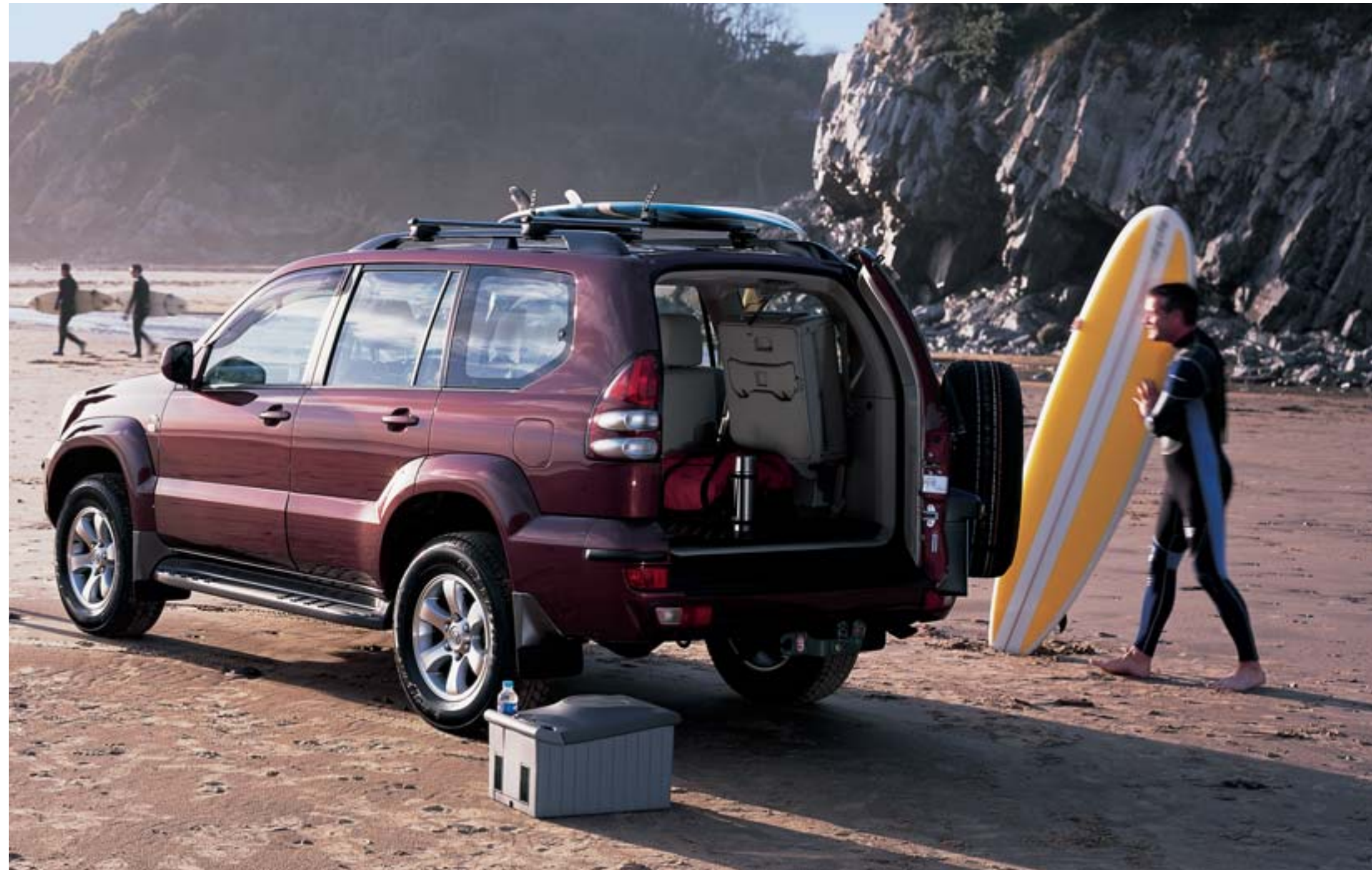
The Land Cruiser – above – is fitted with tow bar, boot liner, cool/hot box and cross bars with sailboard and mast holder.

So, why not see how you can make your Toyota as individual as you are – and check out the full range of accessories at your local Toyota retailer?