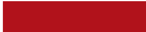
612 Passion Red