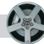
18" Pegasus (Graphite)