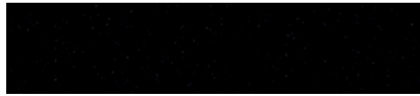
452 Black Sapphire metallic