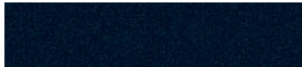
467 Magic Blue pearl