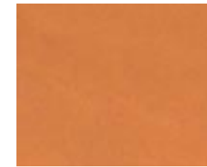
Atacama Natural Leather (9675/A675)