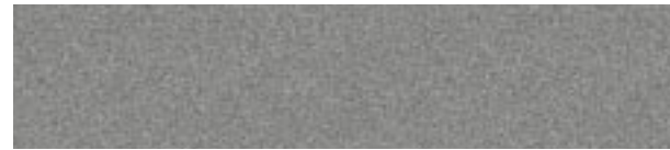
477 Inscription™ Electric Silver Coarse Flake metallic