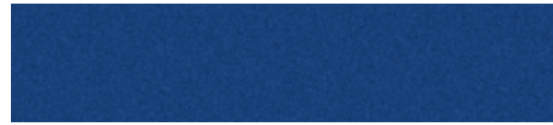
470 Sonic Blue pearl