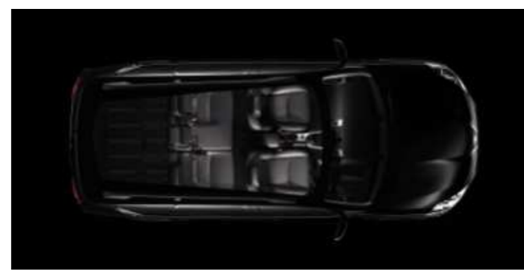
5 seat configuration

Changing the configuration couldn't be simpler either; you can unfold the extra seats in one easy move – and it's just as simple to fold them back down again when you need to open up all that load space.