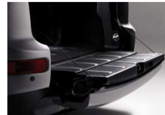
The tailgate folds out flat for easy access