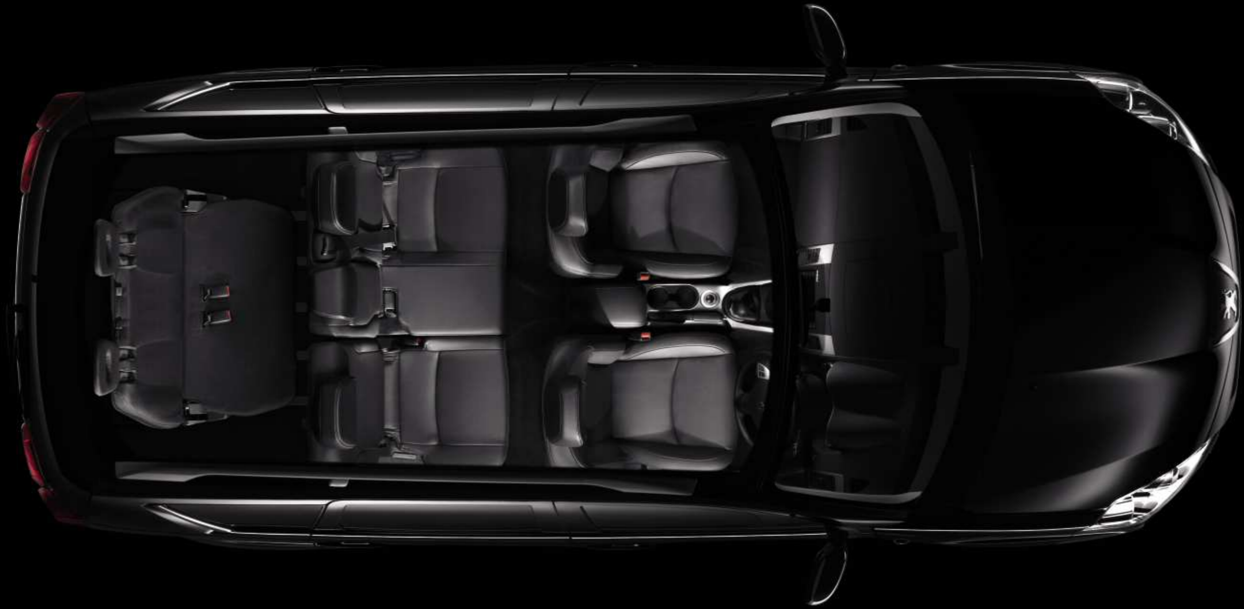
7 seat configuration