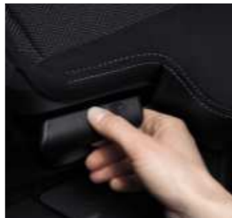
Pull the handle to adjust the seats

Now that's a wide open space worth exploring.