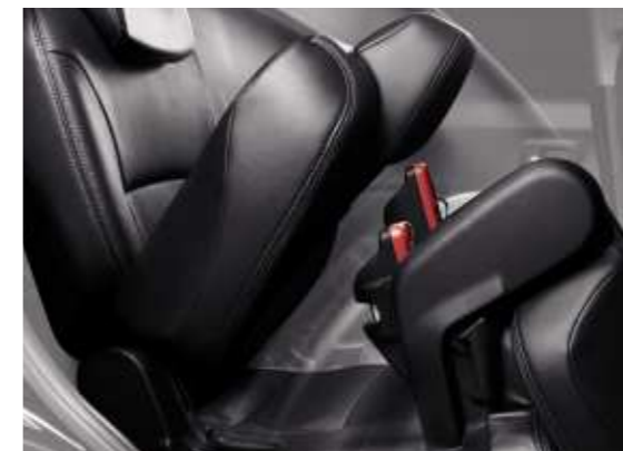
The rear seats get an electronic push to help them fold