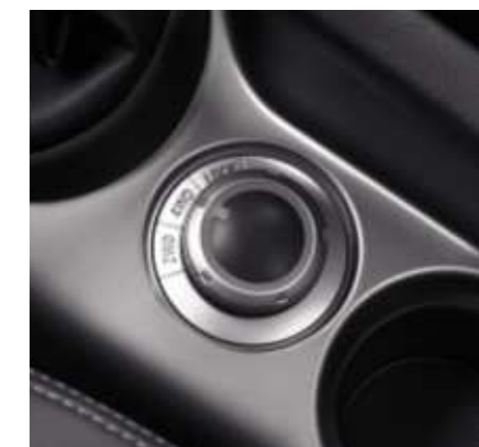
Driving mode dial

Braving the snow, or heading off-road into sand dunes or muddy fields? Select the 4-wheel drive lock mode and you'll be in permanent all-wheel drive with 50/50 front to rear torque distribution. Giving you all the extra traction you're likely to need, particularly at low speeds.