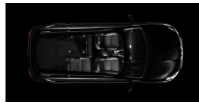
3 seat configuration