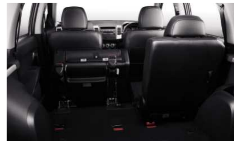
Shows seat in row 2 folding

The seats slide back by up to 80mm. Time for a break? You can recline them. Want extra cargo space? They fold forward effortlessly at the touch of a button. Or if you're planning a really big adventure, the middle row of seats can be split 60/40 and you can slide the seats forwards as well to make way for extra luggage. Two more to go? There's a third row of seats hidden in the boot floor, ready for when you need them to take extra passengers.