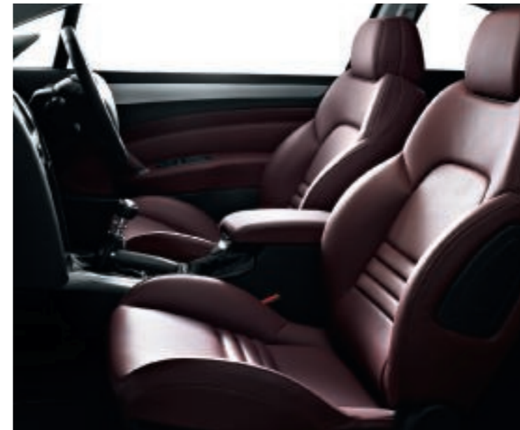
Cerbere Red leather*

* Leather Interior Upholstery: Leather interior versions feature leather trim on the front and rear seats and door panels inserts.