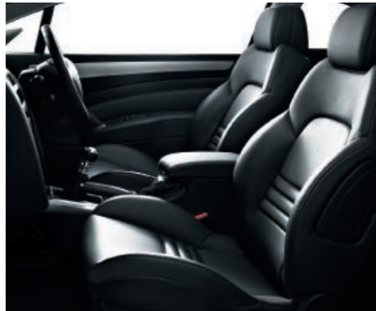
Mistral Black leather*