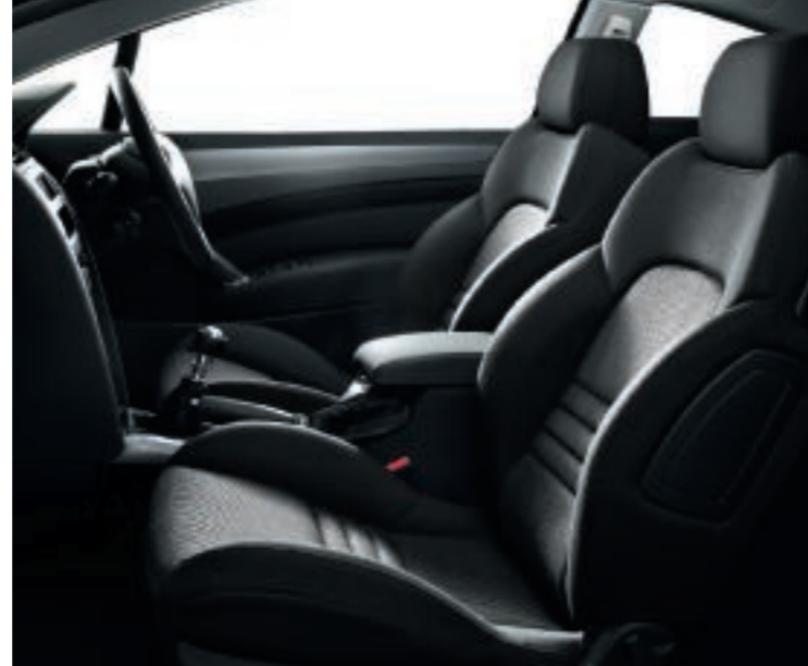
Speedline 2 Black cloth