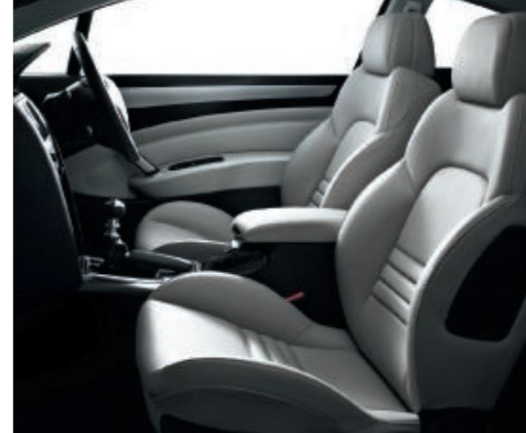
Lama Grey leather*