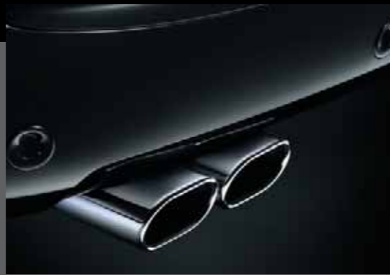
Chromed twin exhaust