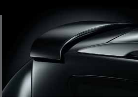
Sleek rear spoiler

Real drivers love curves. And some of the sportiest curves around can be found on the stunning new 407 SW Sport XS.