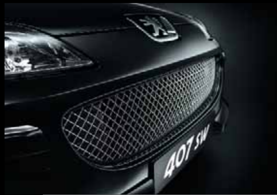
Stylish mesh grille