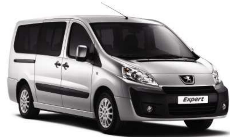
Aluminium metallic paint (option at extra cost).