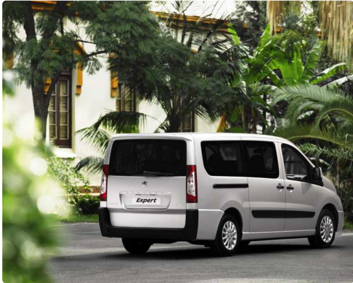
Alloy wheels are optional.