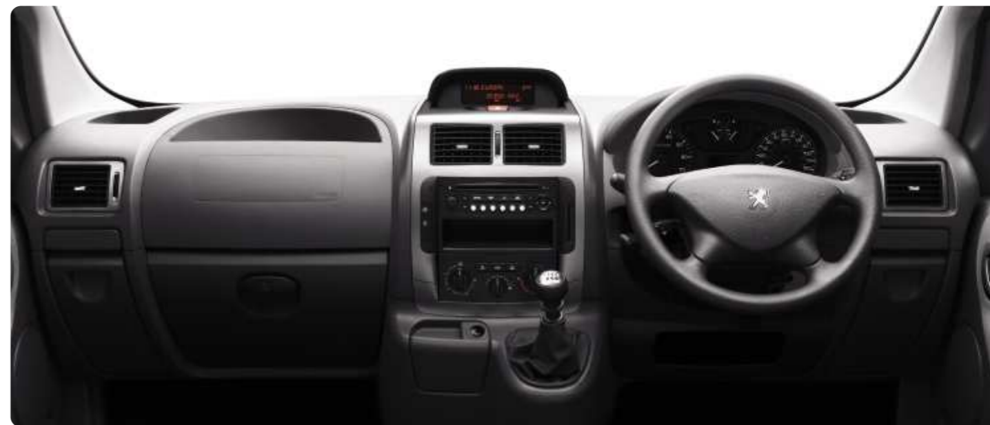
Fascia panel. The ergonomic fascia panel has been designed to ensure maximum convenience while driving and features a three dial instrument panel.

The roof of Expert Tepee comes with six air diffusers on versions equipped with the additional rear air conditioning unit, ensuring an exceptional level of ambient comfort.