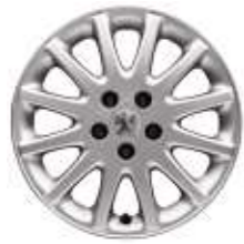
Vivace 16" alloy wheels (option at extra cost)