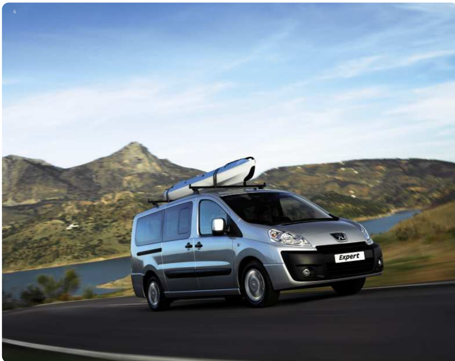
Roof bars come as accessories at extra cost.