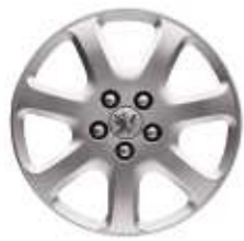
Novae 16" wheel trim