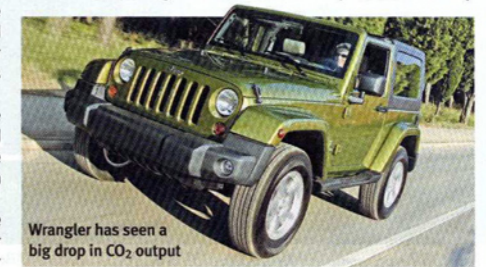
Wrangler has seen a big drop in CO 2 output

However, not all manufacturers are following the green lead of MINI and Jeep. Subaru has actually