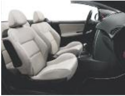
Luxury Oran Grey Leather*