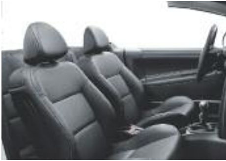
Integral Black leather interior*