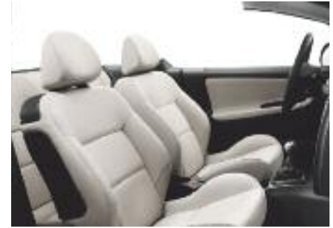
Integral Oran Grey leather*