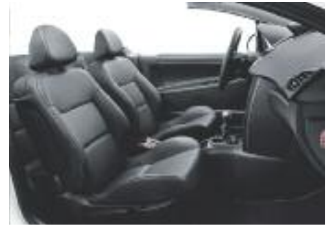
Luxury Black leather*