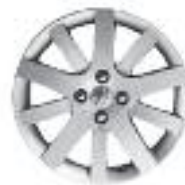
17" Hockenheim Alloy Wheel