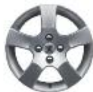
16" Canberra Alloy Wheel