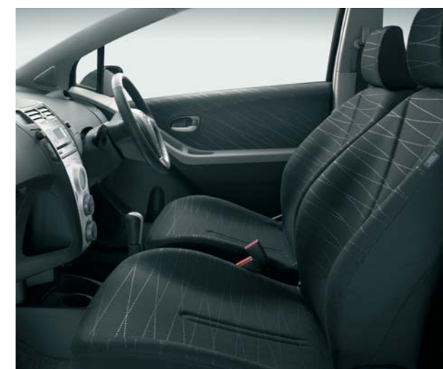
Yaris SR 1.3 and 1.4