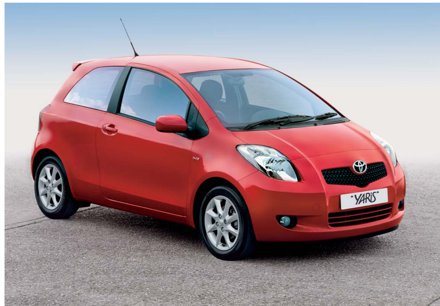
Yaris SR 1.4

Revolutionise your experience of the small car. And feel the power of the stunning, exhilarating Yaris SR 1.8.