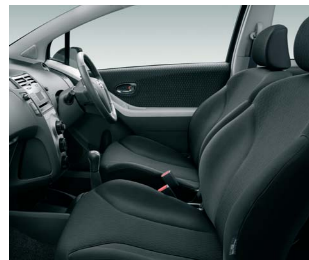
Yaris SR 1.8