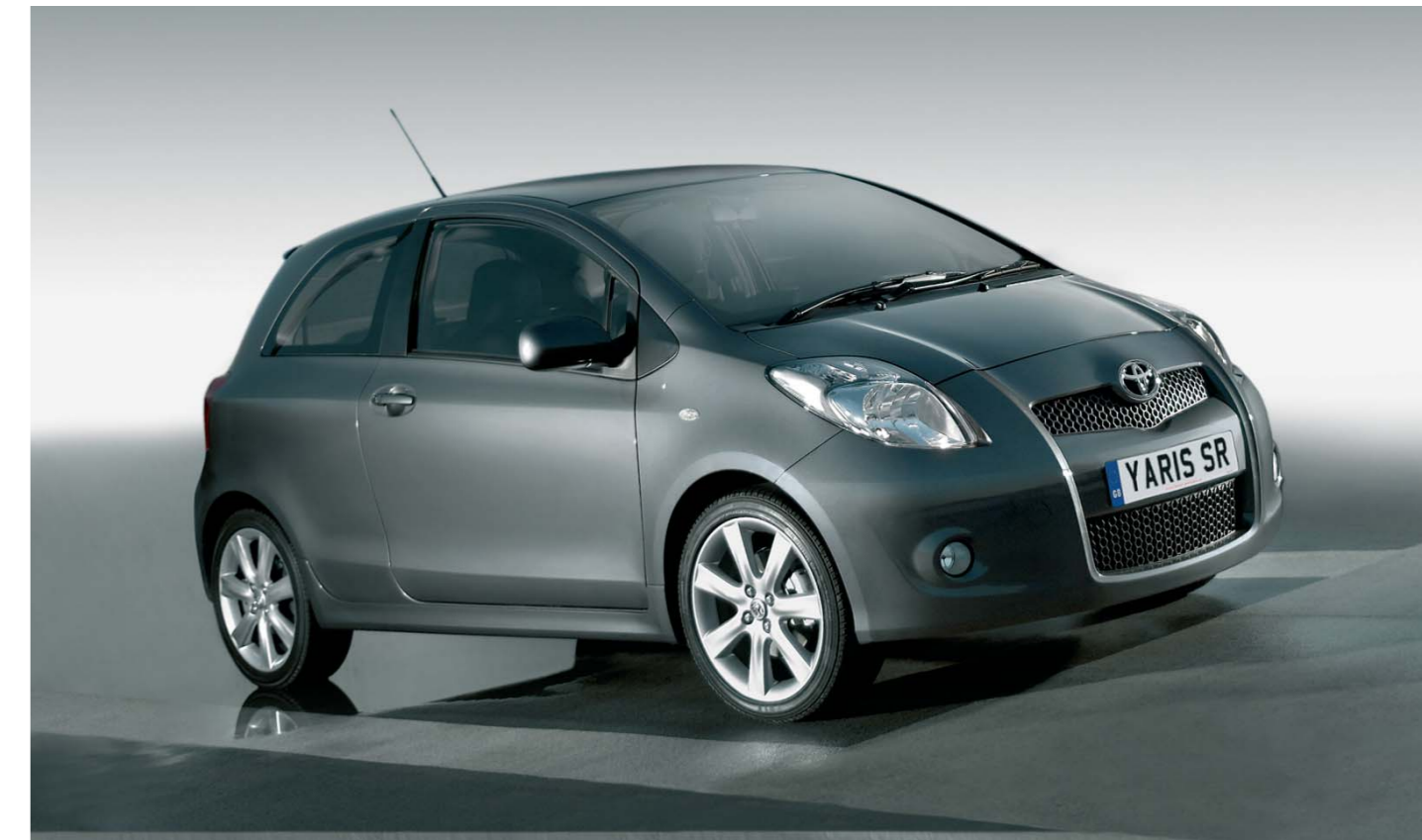
Yaris SR 1.8

Enjoy a compact car that will set your pulse racing. Enjoy the Yaris SR 1.3 and 1.4.