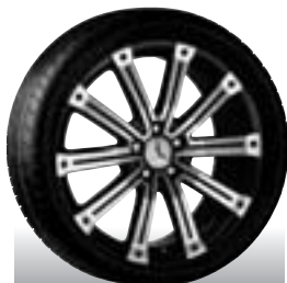
20 TOMEKO 10-spoke wheel 8.5 J x 20 ET 56 · 275/50 R20 B6 647 4528 Finish: two-tone