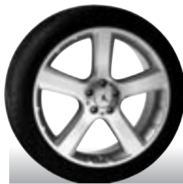
20 5-SPOKE WHEEL