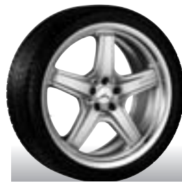
21 AMG 5-SPOKE WHEEL