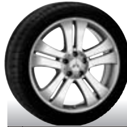
19 5-TWIN-SPOKE WHEEL