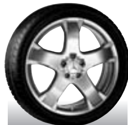
20 TYNDARIDES 5-spoke wheel 8.5 J x 20 ET 56 · 275/50 R20 B6 647 4210 Finish: sterling silver