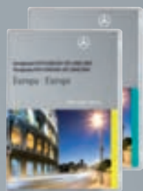
Europe navigation DVD for Audio 50 APS Europe navigation DVD for COMAND APS