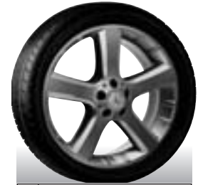
20 5-SPOKE WHEEL