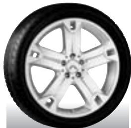
20 RECHEO 5-spoke wheel 8.5 J x 20 ET 56 · 275/50 R20 B6 647 4569 Finish: titanium silver, high-shine