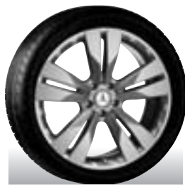
20 5-TWIN-SPOKE WHEEL

Finish: titanium silver or himalayas mid grey B6 647 0165