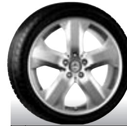
19 5-SPOKE WHEEL