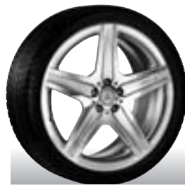
21 AMG 5-SPOKE WHEEL

Finish: silver, high-sheen rim flange; wheel-arch flaring required