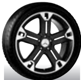
20 RECHEO 5-spoke wheel 8.5 J x 20 ET 56 · 275/50 R20 B6 647 4570 Finish: two-tone