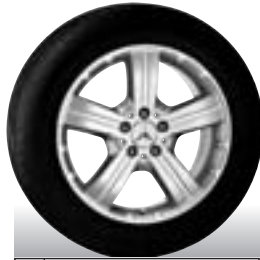
18 5-SPOKE WHEEL