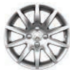
16" Izalco Alloy Wheels