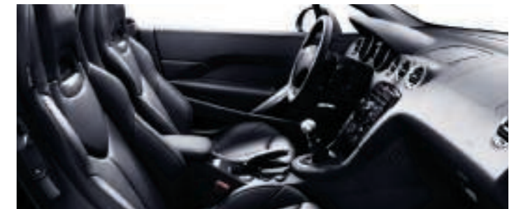
Integral Black Leather