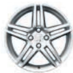
17" Stromboli Alloy Wheels