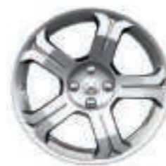
18" Lincancabur Alloy Wheels