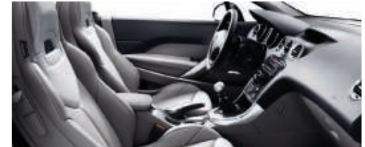
Luxury Grey Lama Leather