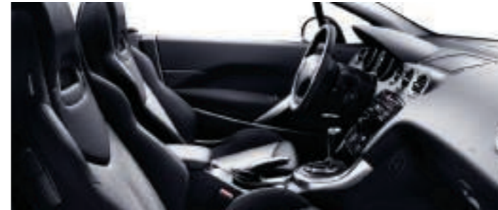
Black / Grey Cloth