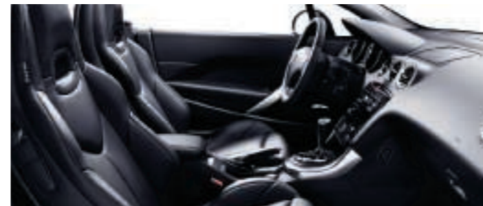
Luxury Black Leather