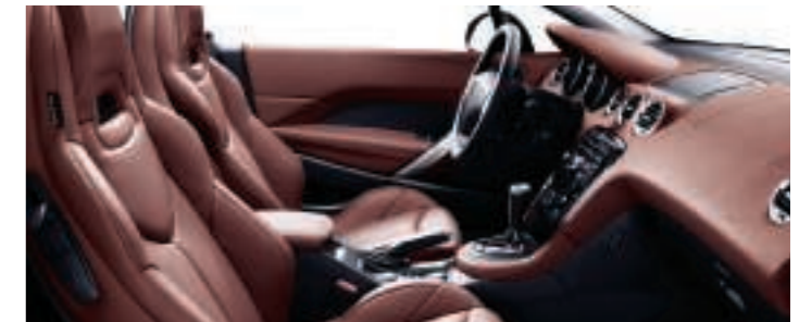
Integral Vintage Leather