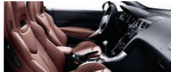
Luxury Vintage Leather