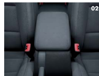
02 Front centre armrest.

The importance of comfort and convenience cannot be over-emphasised. Choose from this range of factory-fitted options to create an interior that meets your individual needs, and makes life just that little bit more comfortable and convenient. From 2Zone electronic climate control to a front centre armrest, from a sunroof to a Winter pack, these essential luxuries are designed to help you relax and take the stress out of driving, adding not only a touch of luxury, but also providing invaluable practical assistance.