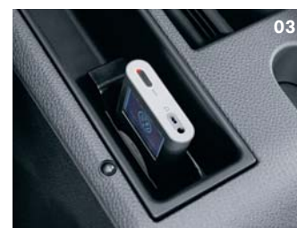
03 iPod preparation.

When it comes to in-car entertainment systems and communications packages, those looking to install a technologically advanced or upgraded system are spoiled for choice. Whether you require concert hall acoustics, the latest navigation system or iPod integration, these factory-fitted options provide state-of-the-art technology and connectivity. Choose the system that best meets your needs, then sit back and enjoy the benefits.