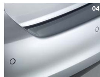
04 Rear parking sensors.

Safety and security have to be a primary consideration, for only when you are feeling totally safe and protected can you completely relax. Whether you are looking to ensure the safety of your passengers, enhance rear safety or make life just that little easier, this range of safety and security features will help you protect passengers and make your Golf more secure, enabling you to enjoy the driving experience so much more.