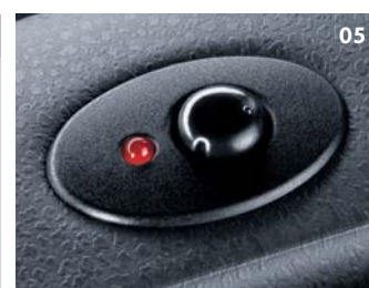
05 Alarm with remote central locking.

Safety and security have to be a primary consideration, for only when you are feeling totally safe and protected can you completely relax. Whether you are looking to ensure the safety of your passengers, enhance rear safety or make life just that little bit easier, this range of safety and security features will help you protect passengers and make your Polo more secure, enabling you to enjoy the driving experience so much more.