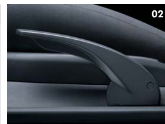
02 Driver's and front passenger's seat height adjustment.

The importance of comfort and convenience cannot be over-emphasised. Choose from this range of factory-fitted options to create an interior that meets your individual needs, and makes life just that little bit more comfortable and convenient. From 'Climatic' semi-automatic air conditioning to driver's and front passenger's seat height adjustment, from a sunroof to a Winter pack, these essential luxuries are designed to help you relax and take the stress out of driving, adding not only a touch of luxury, but also providing invaluable practical assistance.