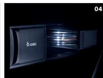
04 6 CD autochanger.

For hours of uninterrupted listening pleasure you can specify a six CD autochanger which is conveniently located in an under seat drawer.