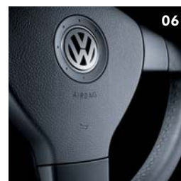
06 Leather trimmed steering wheel.

● Standard equipment ○ Optional equipment – Not available Factory-fitted options are subject to availability and extended delivery.