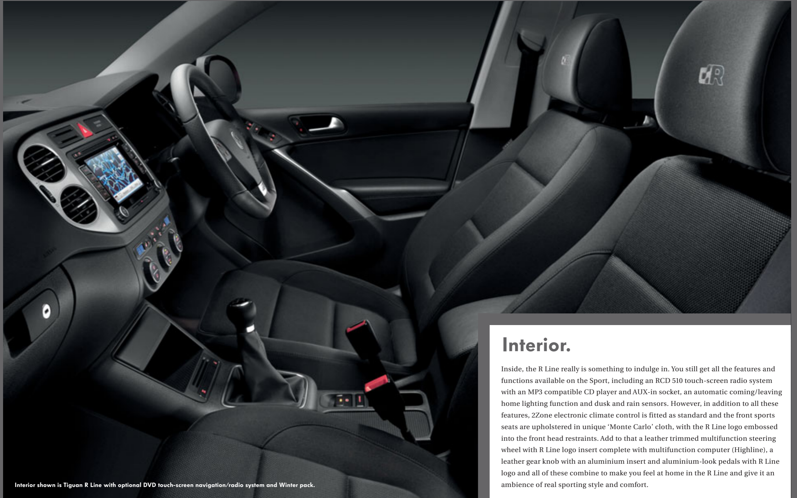
Interior shown is Tiguan R Line with optional DVD touch-screen navigation/radio system and Winter pack.