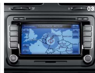
03 RNS 510 DVD touch-screen navigation/radio system.

When it comes to in-car entertainment systems and communications packages, those looking to install a technologically advanced or upgraded system are spoiled for choice. Whether you require the latest navigation system with integrated voice control or a digital radio receiver, these factory-fitted options provide state-of-the-art technology and connectivity. Choose the system that best meets your needs, then sit back and enjoy the benefits.