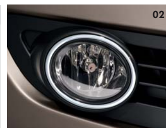
02 Front fog lights.

The exterior styling of a car is not only an expression of its personality, but makes a powerful statement about your own individuality and taste. These factory-fitted options provide an easy and effective way to create a striking visual appearance with great aesthetic appeal, while enjoying some important practical benefits. From Special paint to front fog lights, choose the options best suited to your needs and enhance not only your Golf Plus's exterior looks, but your driving experience too.