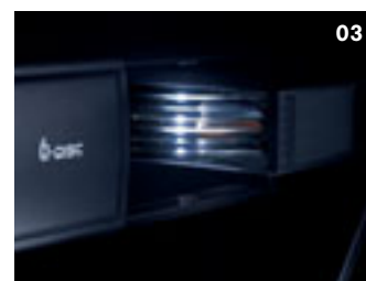
03 Boot-mounted 6 CD autochanger.

If you are looking to upgrade your radio system, these factory-fitted options provide the convenience and entertainment you need to help you enjoy your journey. Choose the system that best meets your needs, then sit back and enjoy the benefits.