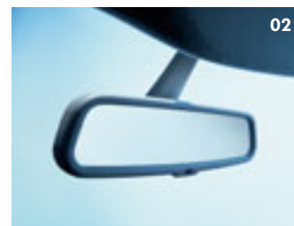
02 Automatic dimming interior rear-view mirror.

The importance of comfort and convenience cannot be over-emphasised. Choose from this range of factory-fitted options to create an interior that meets your individual needs, and makes life just that little bit more comfortable and convenient. From headlight washers to cruise control, from a luggage net to a Winter pack, these luxuries are designed to help you relax and take the stress out of driving, adding not only a touch of luxury, but also providing invaluable practical assistance.