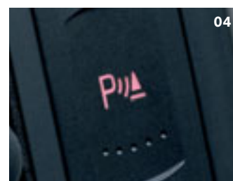
04 Front and rear parking sensors.

Safety and security have to be a primary consideration, for only when you are feeling totally safe and protected can you completely relax. Whether you are looking to ensure the safety of your smallest passengers, enhance rear safety or make life just that little easier, this range of safety and security features will help you protect passengers and make your Sharan more secure, enabling you to enjoy the driving experience so much more.