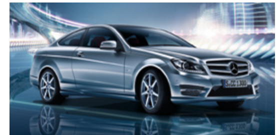
BlueEFFICIENCY measures substantially reduce fuel consumption and CO 2 emissions

efficiency drive, hybrid drivetrains will bring new levels of fuel efficiency and emissions reduction to tomorrow's Mercedes-Benz passenger cars. The petrol/electric HYBRID system allies an economical internal combustion engine to an electric motor that not only assists the engine when accelerating but also recovers kinetic energy during braking. In addition, the system automatically shuts off the engine as the car slows to a standstill, helping to reduce fuel consumption even further. The diesel equivalent, BlueTEC HYBRID , combines the benefits of