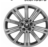
18" 'original' - spirit grey