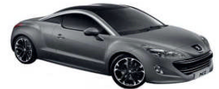
Telluric matt grey