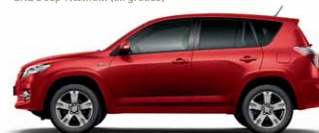
3R3 Vermillion Red (XT-R AWD & SR) §