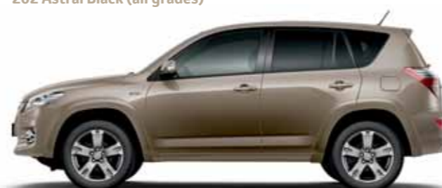
4T3 Light Cappuccino (XT-R AWD & SR) §