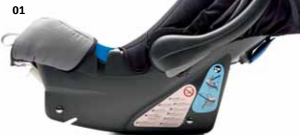
01 Babysafe Plus Comfort and protection for babies from birth up to 13 kg (approximately 15 months).

For maximum safety, Toyota ISOFIX child restraint seats have a simple push-click operation to lock the seat into your RAV4's rear ISOFIX bars and so anchor it directly to the car body. An integral top tether increases stability by helping to prevent the seat tipping forward.