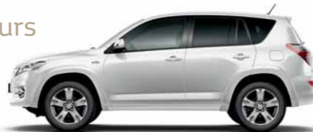
070 White Pearl (XT-R AWD & SR)*