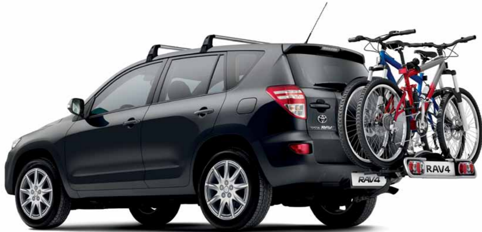
RAV4 fitted with roof bars, 18" Podium alloy wheels, side mouldings and rear bicycle holder, which attaches to a Toyota tow bar.

The power and strength of the RAV4 is an open invitation to fit a tow bar and expand your car's leisure potential by towing a jet-ski, trailer or small caravan. The Toyota roof rack or roof rails & cross bars combine with a wide choice of optional carrying attachments to give you further flexibility for exploring life's big adventures.