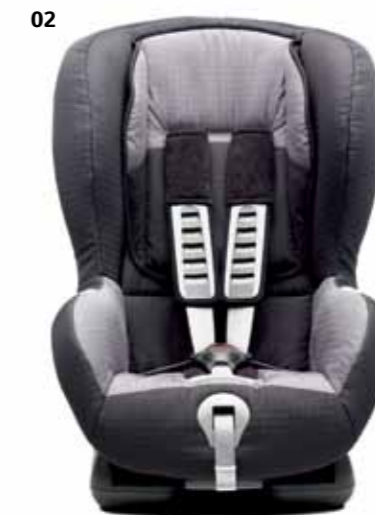
02 Duo Plus G1 ISOFIX restraint seat For children of between 9 to 18 kg (approximately 8 months to 4 years).