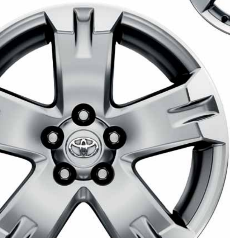
18" alloy wheels 235/55R18 Standard on SR