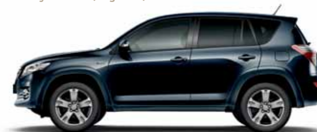
1H2 Deep Titanium (all grades) §