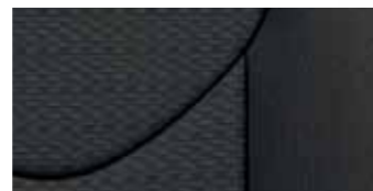
Balada Black fabric Standard on XT-R 2WD