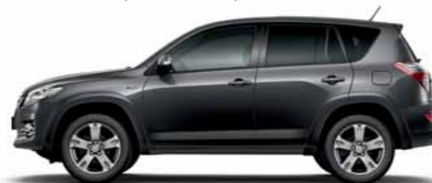
1G3 Decuma Grey (all grades) §