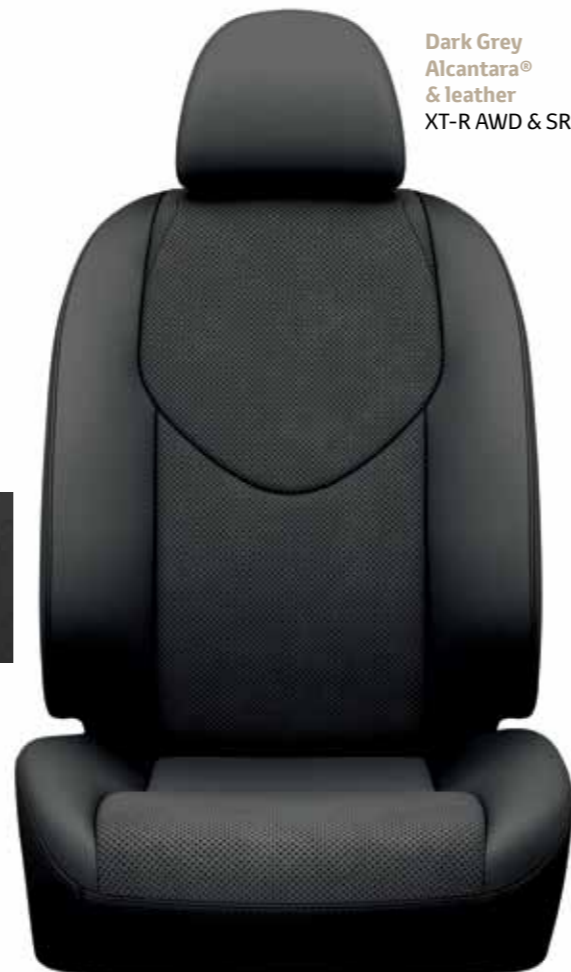
Dark Grey Alcantara® & leather XT-R AWD & SR