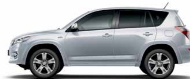
1F7 Tyrol Silver (all grades) §