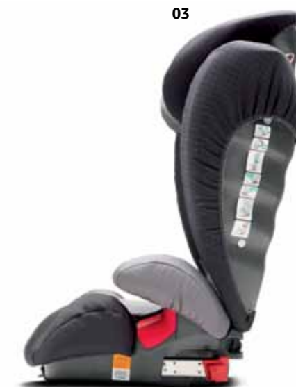
03 Kid G2 ISOFIX restraint seat Height adjustable for children between 15 to 36 kg (approximately three to 12 years).