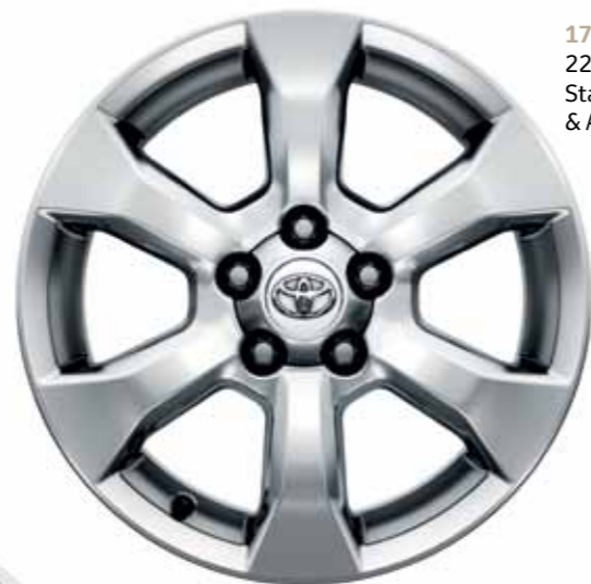
17" alloy wheels 225/65R17 Standard on XT-R 2WD & AWD