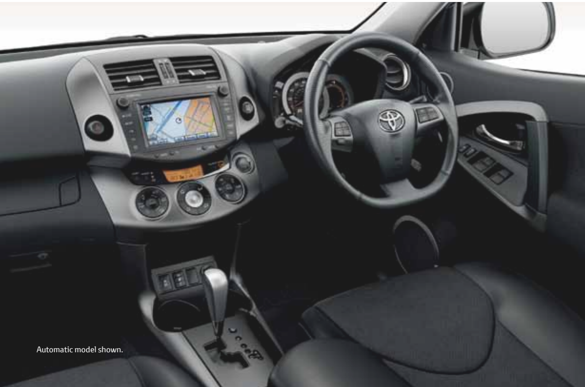
Automatic model shown.