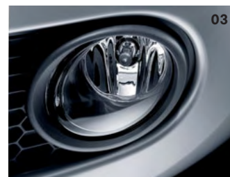
03 Front fog lights.

The exterior styling of a car is not only an expression of its personality, but makes a powerful statement about your own individuality and taste. These factory-fitted options provide an easy and effective way to create a striking visual appearance with great aesthetic appeal, while enjoying some important practical benefits. From Special paint to front fog lights, choose the options best suited to your needs and enhance not only your car's exterior looks, but your driving experience too.