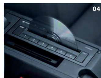
04 6 CD autochanger.

Whether you are looking to add a CD autochanger or iPod integration these factory-fitted options provide the ultimate in advanced electronics, state-of-the-art technology and connectivity. Choose the system that best meets your needs, then sit back and enjoy.