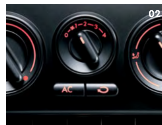
02 Manual air conditioning.

The importance of comfort and convenience cannot be over-emphasised. Choose from this range of factory-fitted options to create an interior that meets your individual needs, and makes life just that little bit more comfortable and convenient. From 'Climatic' semi-automatic air conditioning to cruise control, from carpet mats to a Winter pack, these luxuries are designed to help you relax and take the stress out of driving, adding not only a touch of luxury, but also providing invaluable practical assistance.