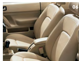
06 Leather upholstery.

The interior of your car is all about aesthetics and luxury, leather upholstery including heated front seats enables you to create a sumptuous interior that is tasteful, elegant and attractive, meeting your individual needs perfectly, and providing the highest levels of comfort and driving pleasure. Sit back, relax and enjoy your surroundings.