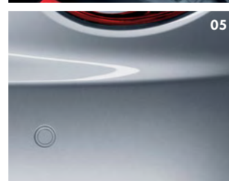
05 Rear parking sensors.

Safety and security have to be a primary consideration, for only when you are feeling totally safe and protected can you completely relax. For example, the rear parking sensors take the worry out of reversing into tight spaces.