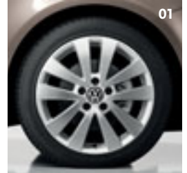
01 'Seattle' 7J x 17 alloys wheels.

Add a touch of style and personality with this great choice of alloys. Alloys add a distinctively sporting look to your car, carefully chosen to enhance the exterior styling of every model, these options give you plenty of opportunity to express your individuality and transform the appearance of your Golf Plus.