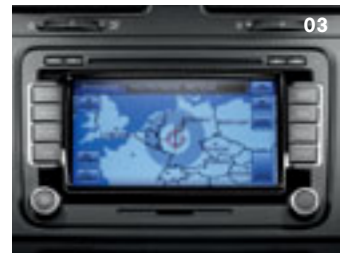
03 RNS 510 DVD touch-screen navigation/radio system.

When it comes to in-car entertainment systems and communications packages, those looking to install a technologically advanced or upgraded system are spoilt for choice. Whether you require the latest navigation system with integrated voice control or a digital radio receiver, these factory-fitted options provide state-of-the-art technology and connectivity. Choose the system that best meets your needs, then sit back and enjoy the benefits.