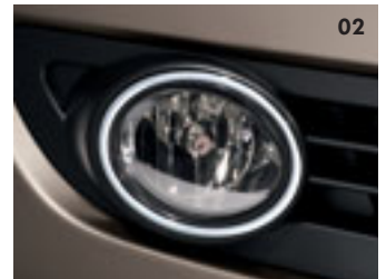
02 Front fog lights.

The exterior styling of a car is not only an expression of its personality, but makes a powerful statement about your own individuality and taste. These factory-fitted options provide an easy and effective way to create a striking visual appearance with great aesthetic appeal, while enjoying some important practical benefits. From Special paint to front fog lights, choose the options best suited to your needs and enhance not only your Golf Plus's exterior looks, but your driving experience too.