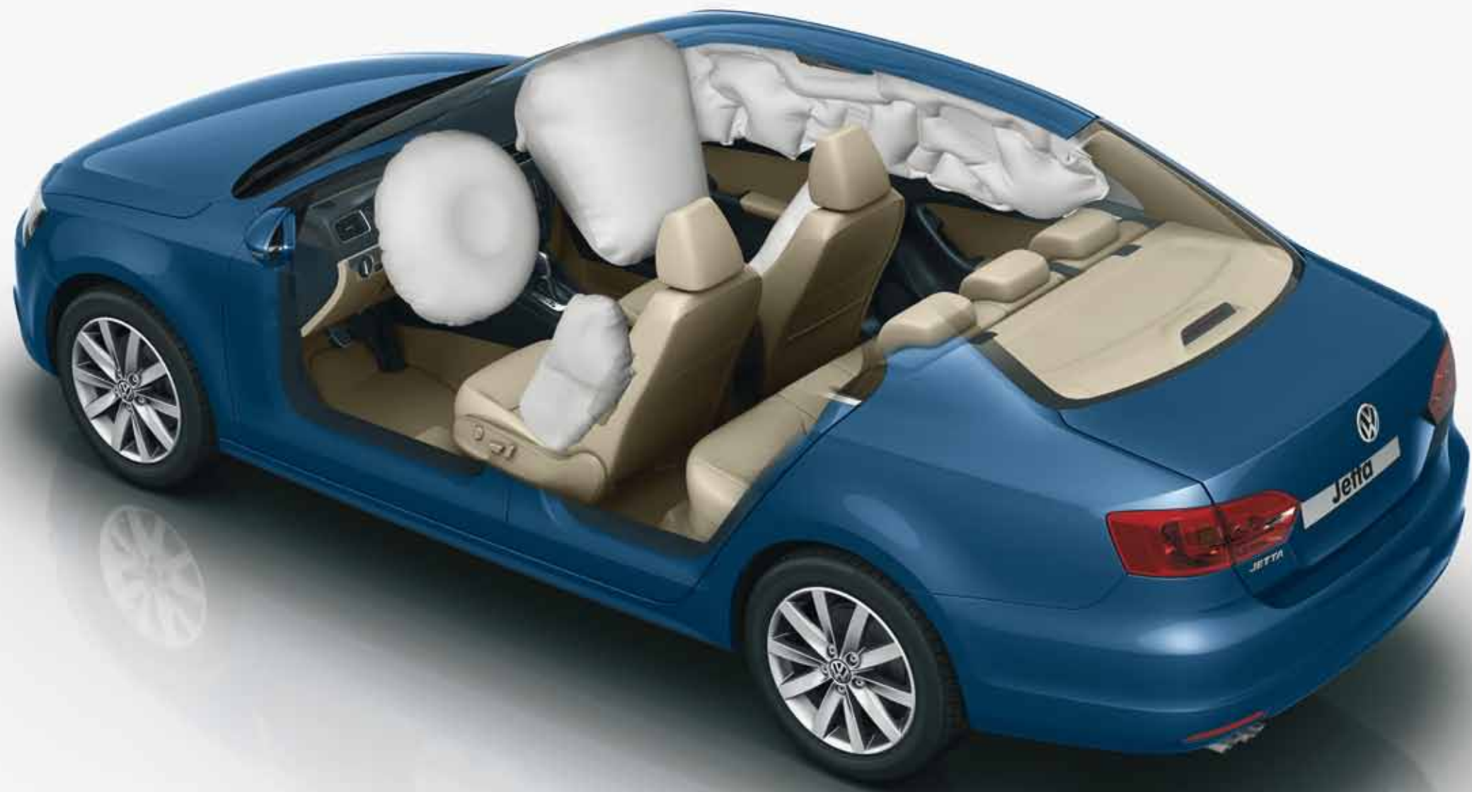
Image shown is for illustration purposes only and may not necessarily reflect UK specification.