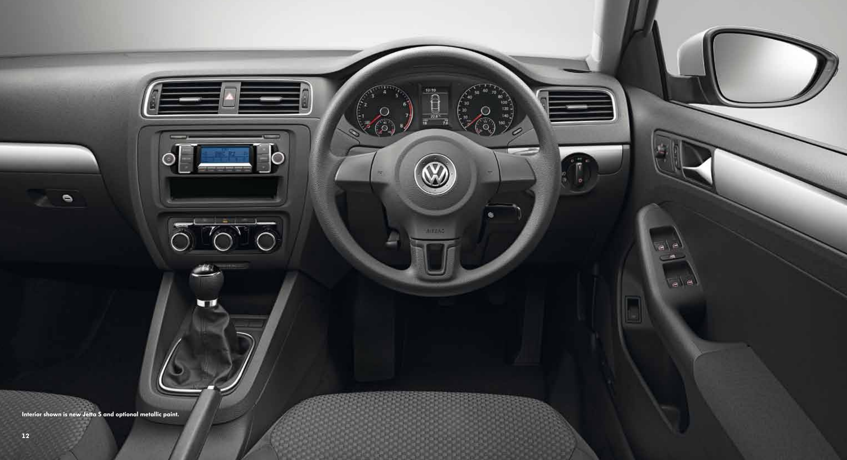
Interior shown is new Jetta S and optional metallic paint.