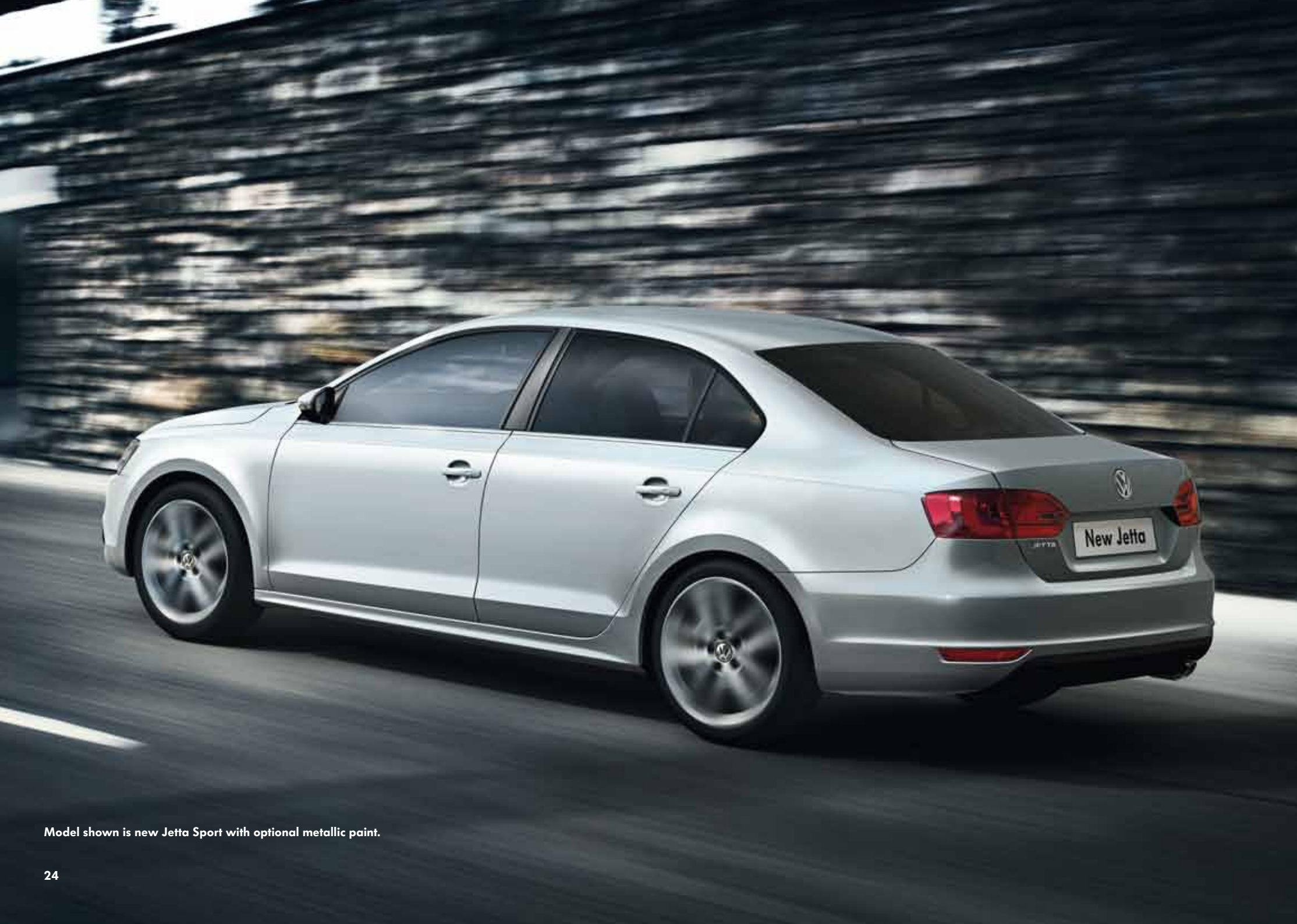
Model shown is new Jetta Sport with optional metallic paint.