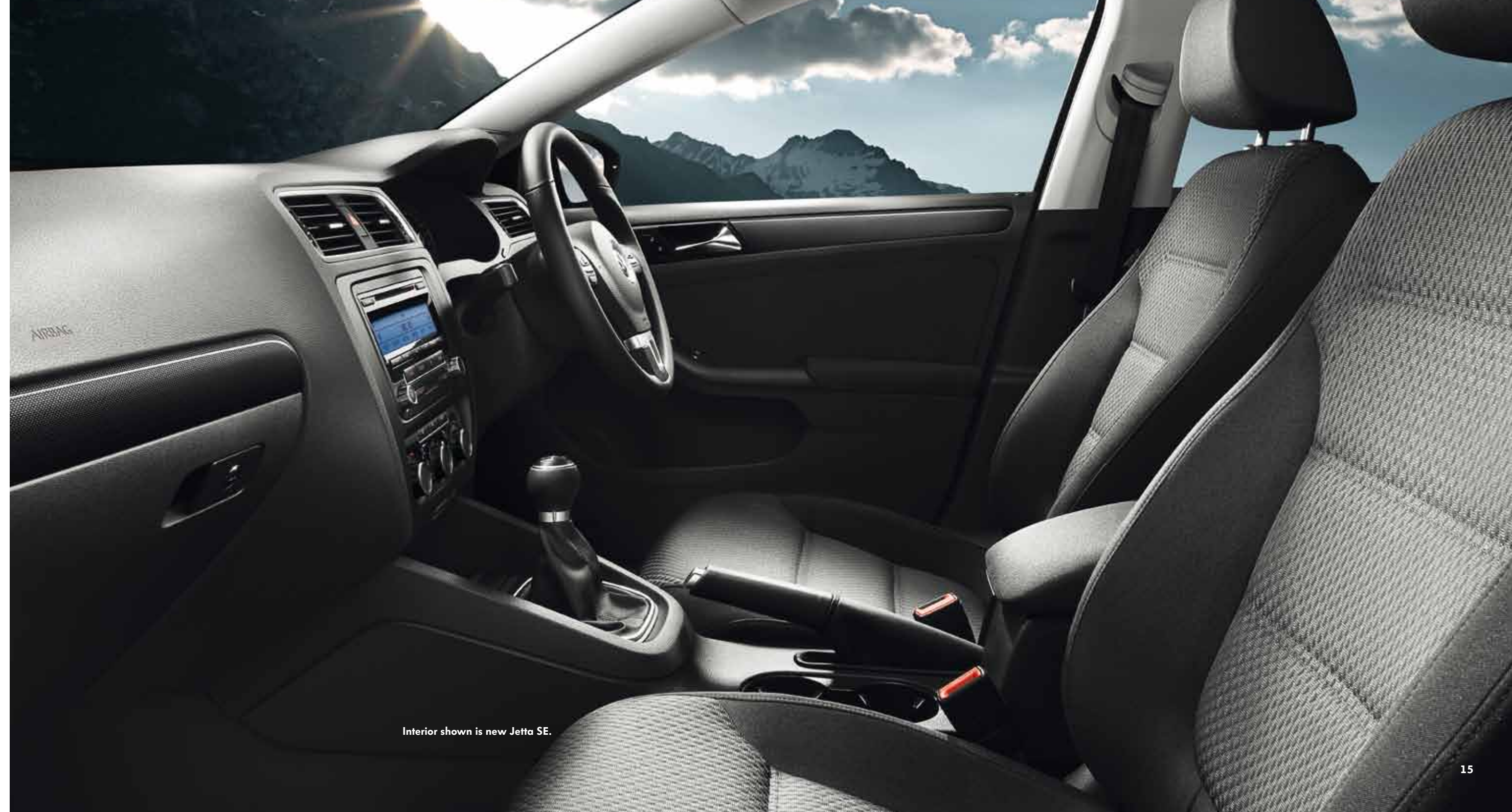
Interior shown is new Jetta SE.

* Please note, 'Vienna' leather upholstery will not be available to order until early Spring 2011.