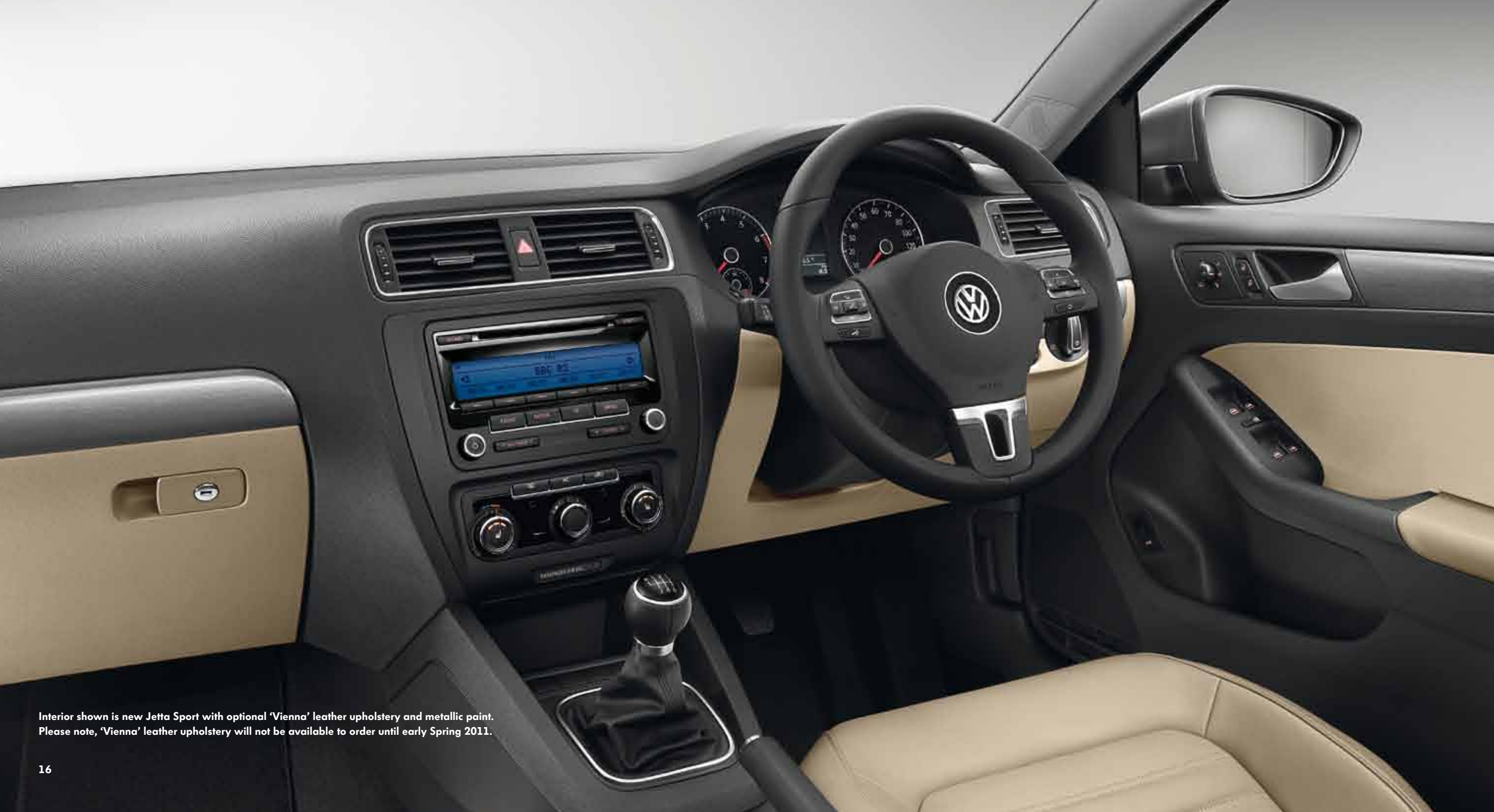
Interior shown is new Jetta Sport with optional 'Vienna' leather upholstery and metallic paint. Please note, 'Vienna' leather upholstery will not be available to order until early Spring 2011.