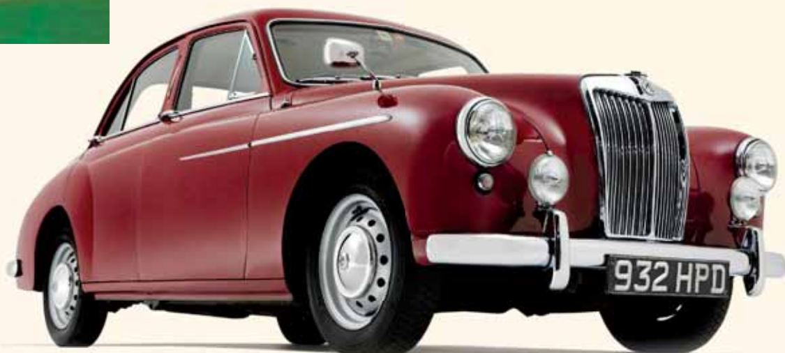
The ZA Magnette.