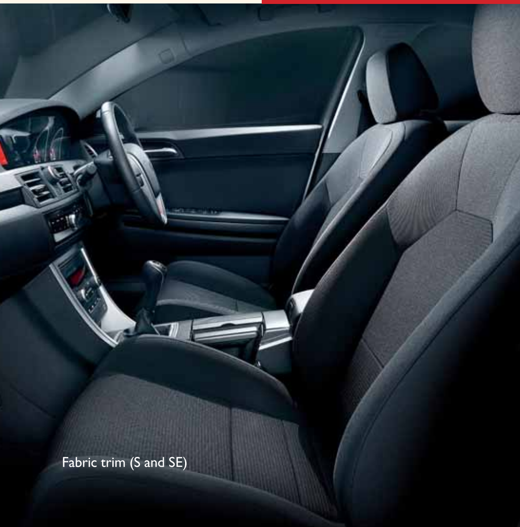
Fabric trim (S and SE)

With the iconic octagonal badge gracing the steering wheel and modern technology at your fingertips, the interior styling of the MG6 Magnette is a perfect marriage of sporting heritage and modern day luxury.