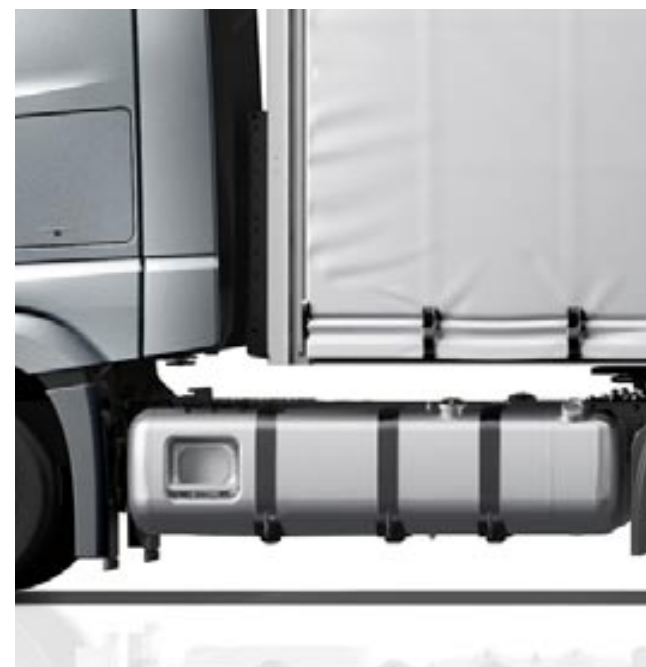
Large volumes and Euro VI as well – with a fuel tank volume of up to 990 l for semitrailer tractors and up to 1000 l for low-frame platform trucks, the Actros Volumer provides an especially long range for high-volume haulage