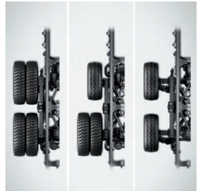
Payload-optimised tyre concepts. For transporting 8 m 3 of ready-mixed concrete the Arocs 8x4/4 concrete mixer is equipped with two widened hypoid rear axles for single tyres and particularly high-load-capacity 385/65 R22.5 wide-base tyres. As well as the payload gained, the low consumption also boosts efficiency

two specially developed, widened hypoid rear axles for single tyres and 385/65 R22.5 wide-base tyres. Alongside the reduction of weight, this combination also supports particularly low consumption. On request the Arocs Loader concrete mixer can be equipped with an M-cab. In addition, for the Arocs Loader semitrailer tractors, 2300 mm wide L-cabs are available. Also on offer: the Euro VI engines in the 10.7l displacement class – they can be selected in four output levels with up to 315 kW (428 hp). But the fact that the Arocs Loader tractor units and concrete mixers are among the lightest in construction transport does not mean that you have to relinquish the hallmark robustness. For only those who take that extra payload to its destination reliably can also take more efficiency to the construction site. As the Arocs Loader does.