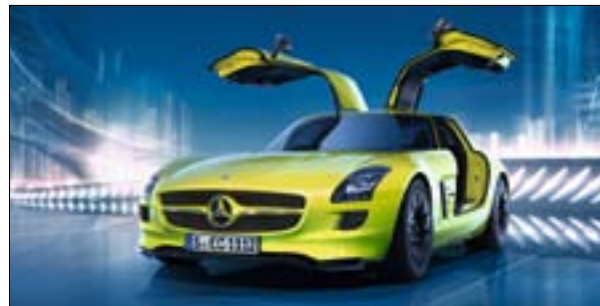
The SLS AMG E-CELL 1 : local emissions-free driving with a battery-powered electric motor

E-Cell and B-Class F-Cell vehicles. The F-Cell, whose electric motor is powered by a hydrogen fuel cell, recently completed the F-Cell World Drive endurance test, proving itself in all kinds of driving conditions. The E-Cell meanwhile, which is powered by twin lithium-ion batteries and has a range of more than 120 miles, is currently being trialled in real-world conditions by drivers across Europe. In 2013, we also expect to begin production of the SLS AMG E-Cell, 1