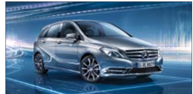
BlueEFFICIENCY measures substantially reduce fuel consumption and CO 2 emissions

efficiency and emissions reduction to tomorrow's Mercedes-Benz passenger cars. The petrol/electric HYBRID system allies an economical internal combustion engine to an electric motor that not only assists the engine when accelerating but also recovers kinetic energy during braking. In addition, the system automatically shuts off the engine as the car slows to a standstill, helping to reduce fuel consumption even further. The diesel equivalent, BlueTEC HYBRID ,