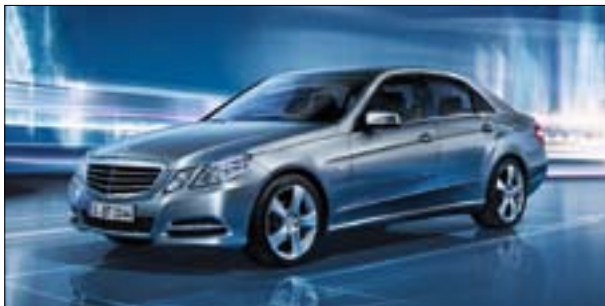
The HYBRID system lowers fuel consumption by up to 20%

E-Cell and F-Cell – new drivetrain concepts. We are also committed to the development of electric powertrains that produce zero local emissions. To this end, we've already produced limited runs of our A-Class