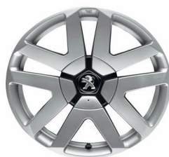
17" Oltis Alloy