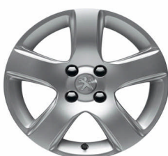
16" Isara Alloy