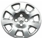
15" steel wheel