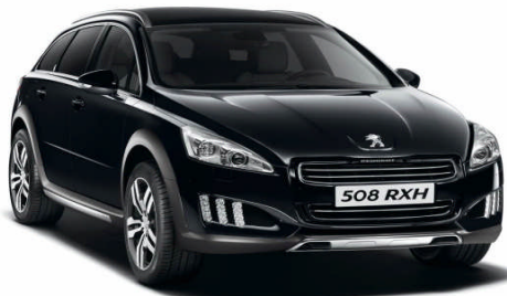
Nera Black (M09V)