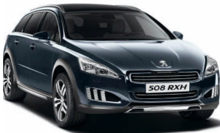
Thorium Grey (M09H)