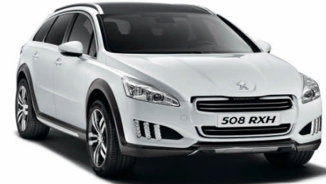
Pearlescent White (M6N9)