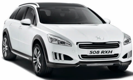
Bianca White (P0WP)