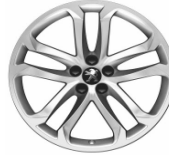
19" 'solstice' anthra grey