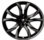
19" 'Sortilege' midnight silver