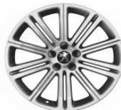
18" 'original' - dark grey