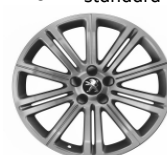
18" 'original' - spirit grey