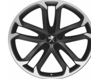
19" 'solstice' onyx black