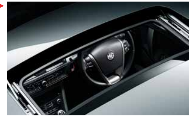
Electric sunroof ▶