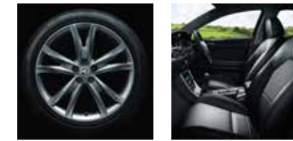
▲ Magnette 18" Alloy wheel + Leather interior