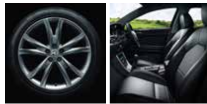
▲ 18" Alloy wheel + Leather interior (TSE trim)