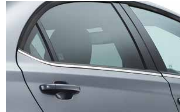
All round electric windows and chrome detailing ▲