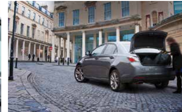
◀ Remote open boot