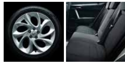
▲ 17" Alloy wheel (S+SE trim)