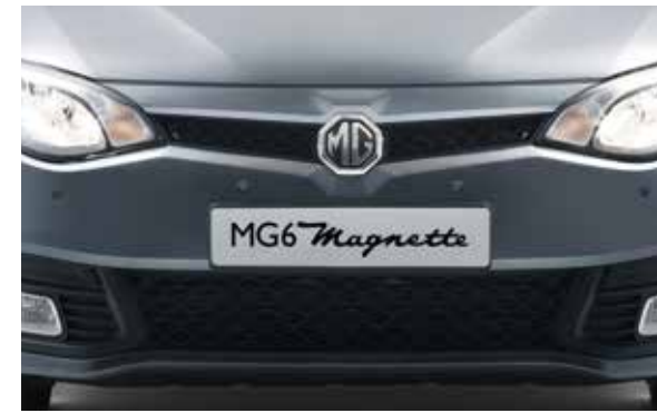
◀ Front parking sensors