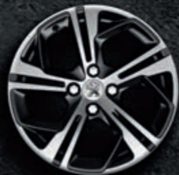
17" 'Carbone' Onyx Black Alloy Wheel (Optional)