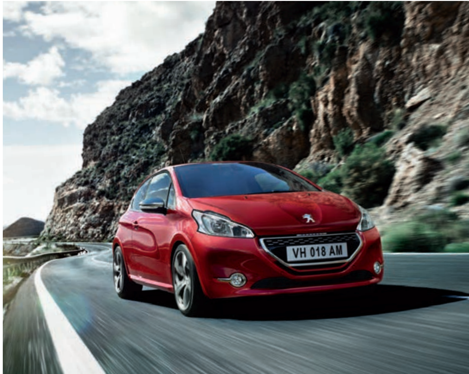
PEUGEOT 208 GTi