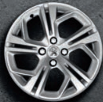
17" 'Carbone' Alloy Wheel (Optional)

You can choose from three different alloy wheel finishes.