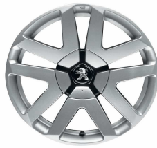
17" Oltis Alloy