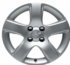
16" Isara Alloy