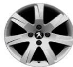
16" Steel Wheel