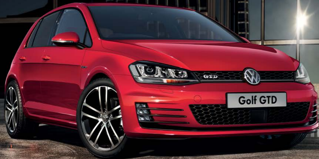
Model shown is Golf GTD.