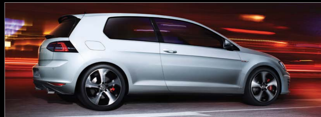
Images shown are Golf GTI with optional GTI Performance pack and premium paint.