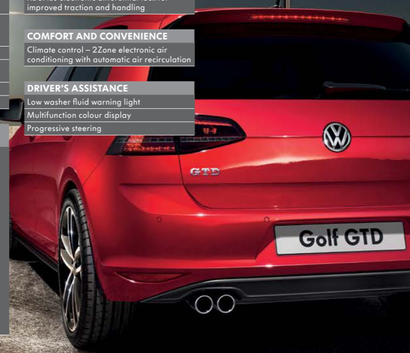
Model shown is Golf GTD.