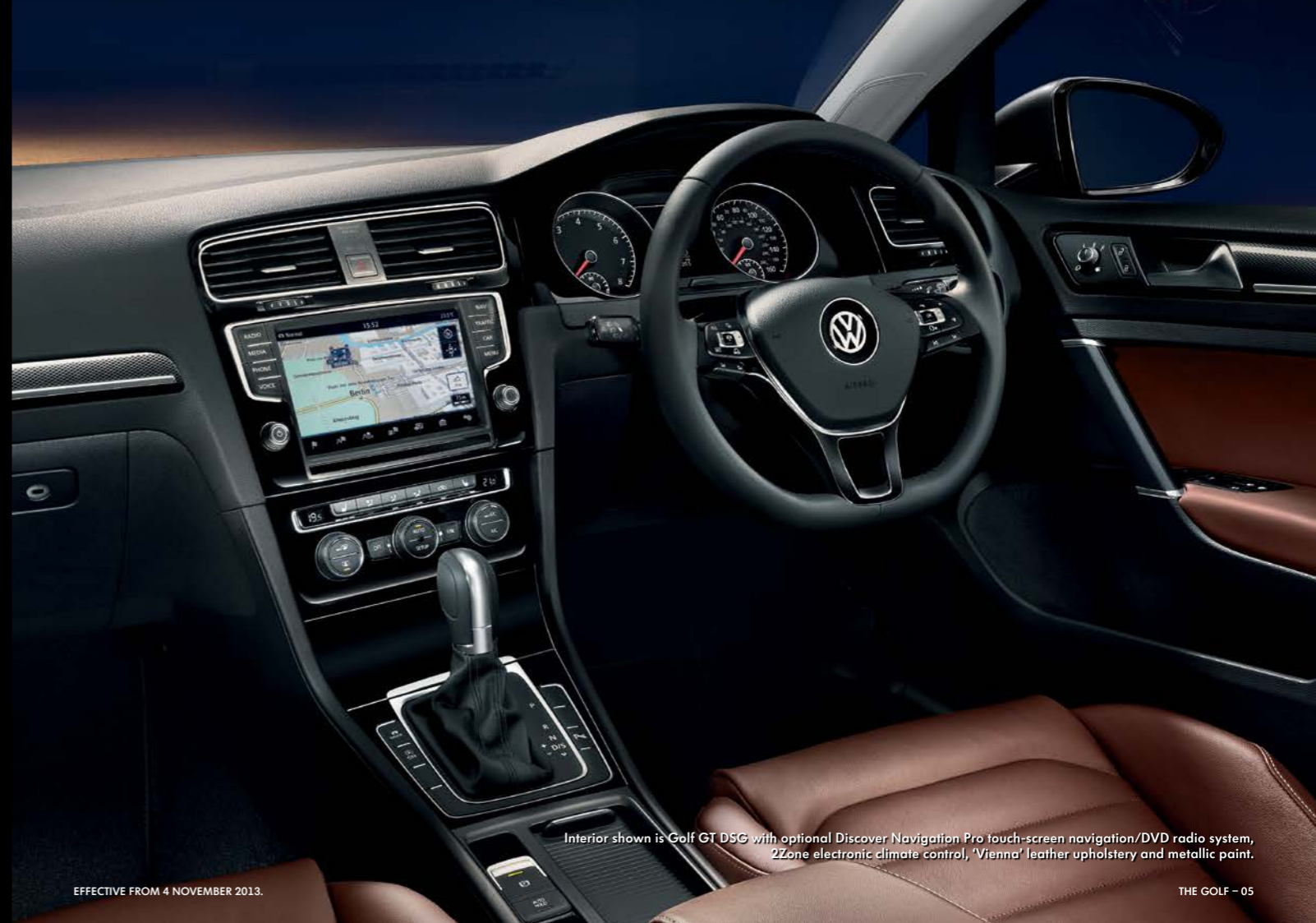
Interior shown is Golf GTI DSG with optional Discover Navigation Pro touch-screen navigation/DVD radio system, 2Zone electronic climate control, 'Vienna' leather upholstery and metallic paint.

For pricing and further details, please consult your authorised Volkswagen retailer.