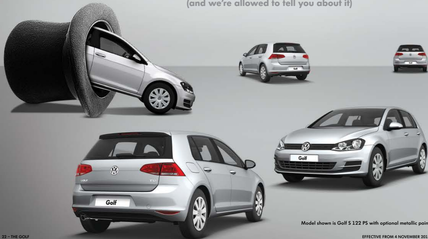
Model shown is Golf S 122 PS with optional metallic paint.

(and we're allowed to tell you about it)