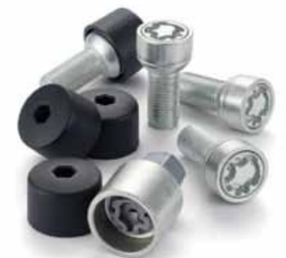
Volkswagen Approved Wheel bolt locking set

This wheel bolt locking set ensures your alloy wheels have maximum protection against theft.