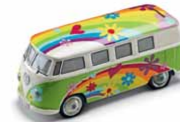
Volkswagen Genuine Money box - green love