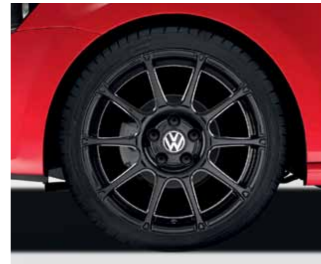
Volkswagen Genuine Motorsport alloy wheel

Wheel size: 7J x 17" Tyre size: 205/40 R17, 215/35 R17 and 215/40 R17