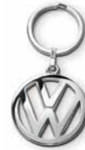
Volkswagen Approved Silver logo key ring

Ask a member of staff about the full range of Volkswagen merchandise today, or visit www.volkswagenmerchandise.co.uk