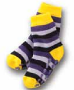
Volkswagen Genuine Anti-slip baby socks - yellow/purple

Pack of two Part number 000 084 404 HTF £8.00