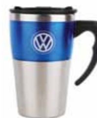
Volkswagen Approved Thermo mug

Pack of two Part number 000 084 404 HTF £8.00