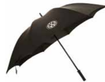
Volkswagen Approved Golf umbrella - black