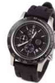
Volkswagen Approved Men's chronograph watch