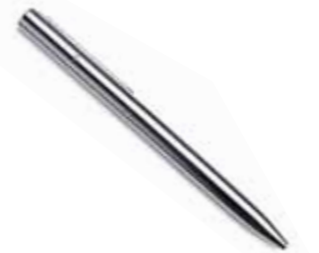
Volkswagen Approved Silver slimline pen