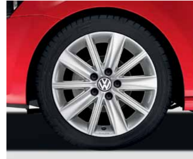
Volkswagen Genuine Zirkonia alloy wheel

Wheel size: 6J x 15" Tyre size: 185/60 R15