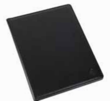
Volkswagen Approved A4 conference folder - black