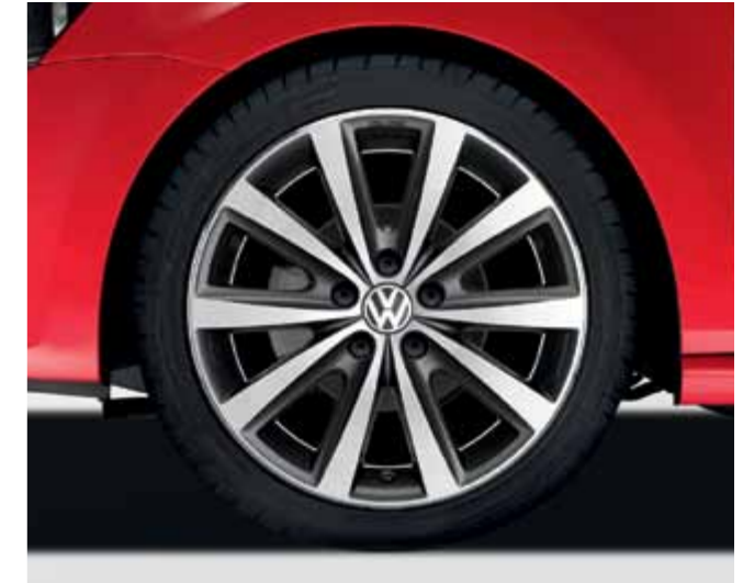
Volkswagen Genuine Syenit alloy wheel

Wheel size: 7J x 16" Tyre size: 195/45 R16, 195/50 R16, 205/45 R16, 215/40 R16 and 215/45 R16