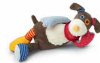
Volkswagen Genuine Ted Turbo soft toy