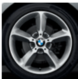
17" Star-spoke style 382