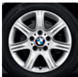
16" Star-spoke style 377