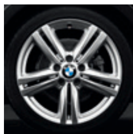
18" M Star-spoke style 386 M