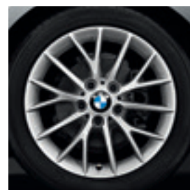
17" Y-spoke style 380