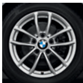
16" V-spoke style 378