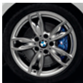
18" M Double-spoke style 436 M