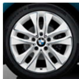
17" V-spoke style 412