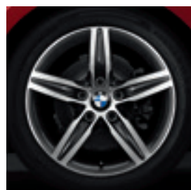
17" Star-spoke style 379