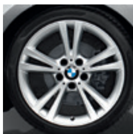
18" Double-spoke style 385