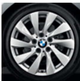
17" Turbine-spoke style 381