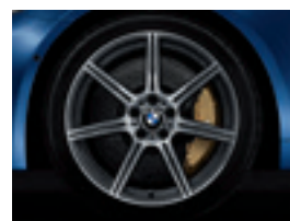
20" M Double-spoke style 601 M