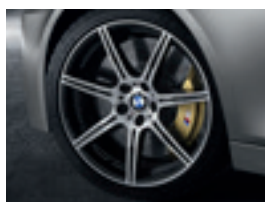
20" M Double-spoke style 601 M, Bi-colour