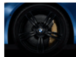
20" M Double-spoke style 343 M, Black