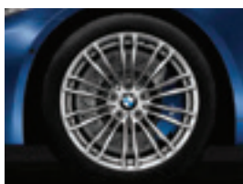
19" M Double-spoke style 345 M