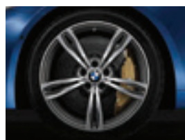
20" M Double-spoke style 343 M