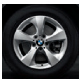
17" Streamline style 306