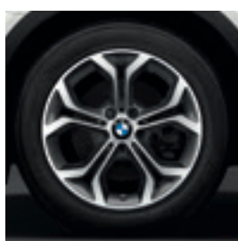
18" Y-spoke style 607