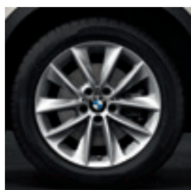
18" V-spoke style 307