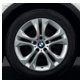
18" Double-spoke style 605