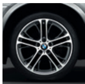
20" M Double-spoke style 310 M