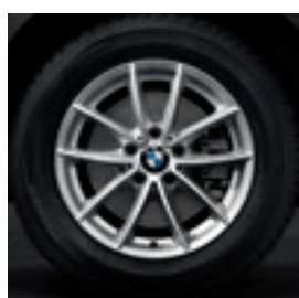
17" V-spoke style 304