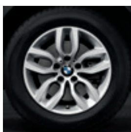
17" Y-Spoke style 305