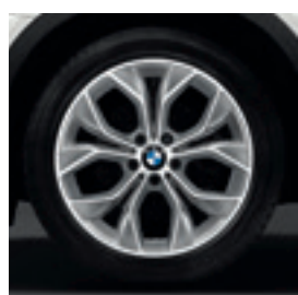
19" Y-spoke style 608