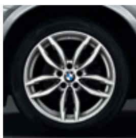
19" M Double-spoke style 622 M