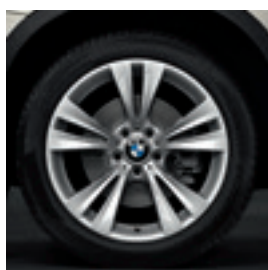
19" Double-spoke style 309