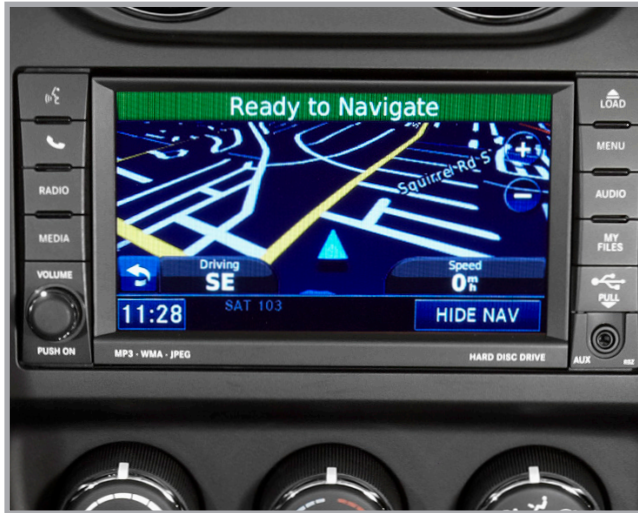
Sound and Navigation Group

*Bright White (PW7) is non-chargable paint. Please see colour combinations.