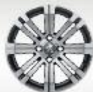
16" Cetus alloy wheels