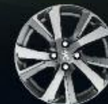
17" 'Eridan' alloy wheel - Anthra **