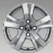
15" Draco alloy wheels