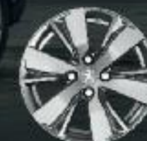
16" 'Hydre' alloy wheel - Gris dilium **