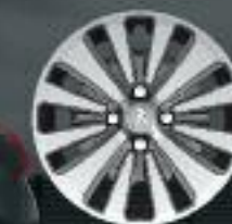
16" Steel wheel with 'Strontium' wheel trim **