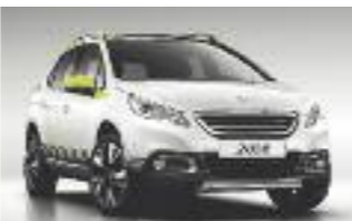
DOWNTOWN CUSTOMISATION KIT: CITRUS