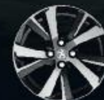
17" 'Eridan' alloy wheel - Brilliant Black **