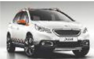
DOWNTOWN CUSTOMISATION KIT: ORANGE