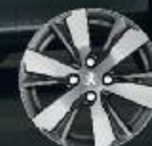
16" 'Hydre' alloy wheel - Anthra **