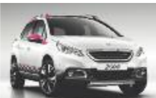
DOWNTOWN CUSTOMISATION KIT: FLASH PINK