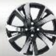
17" Pixis alloy wheels