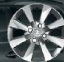
15" Steel wheel with 'Iode' wheel trim **