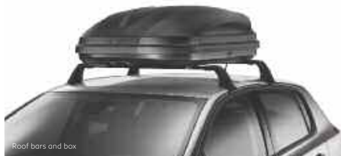
Roof bars and box