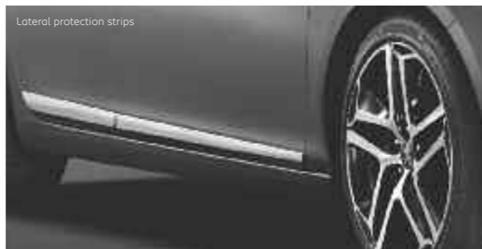
Lateral protection strips