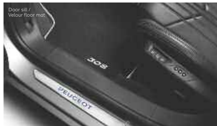
Door sill / Velour floor mat