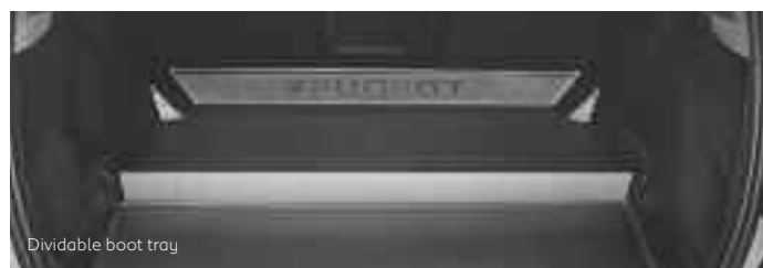
Dividable boot tray