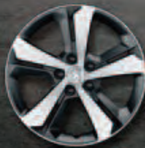
17" Rubis alloy wheels