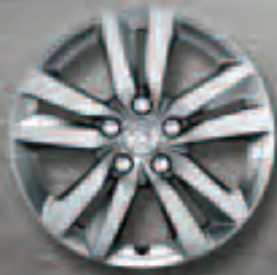
16" Quartz alloy wheels