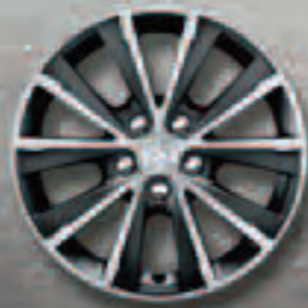
16" Diamond alloy wheels