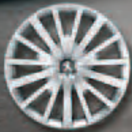
15" steel wheels with Ambre trims