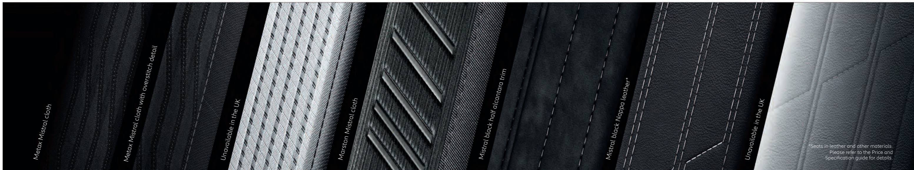
Metax Mistral cloth