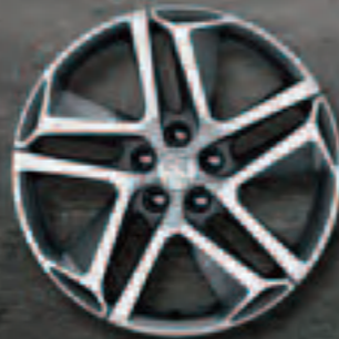
18" Saphir alloy wheels

*Available according to version. Please refer to the price and specification guide for details.