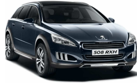
Thorium Grey (M09H)