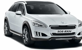
Pearlescent White (M6N9)