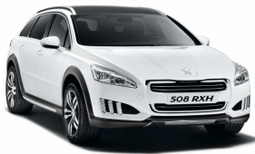
Bianca White (P0WP)