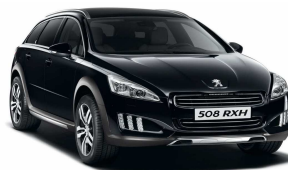
Nera Black (M09V)