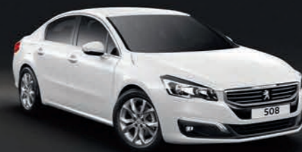
PEARLESCENT PAINT - Pearl White