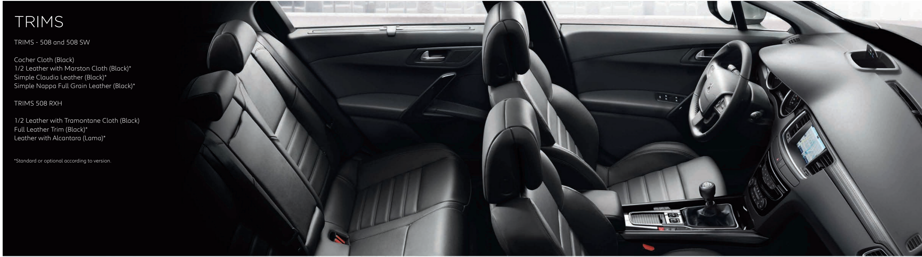
Cocher Cloth (Black)

*Standard or optional according to version.