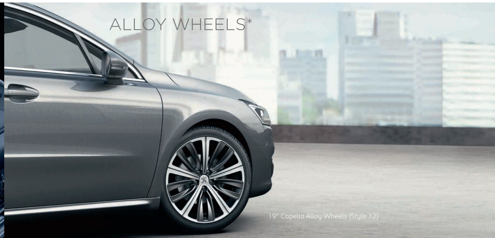
19" Capella Alloy Wheels (Style 12)