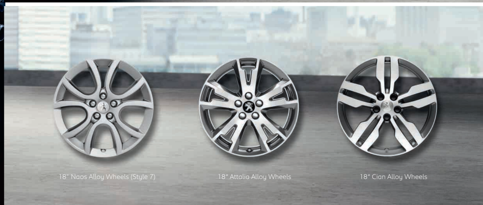
18" Naos Alloy Wheels (Style 7)