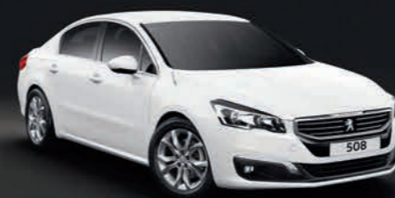
SOLID PAINT - Bianca White