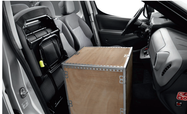
table and the seat can be lifted to access a secure storage compartment.

space and also allows for high loads to be transported in the cabin. The central seat offers a mobile office function as the seat back can be folded down to create a writing