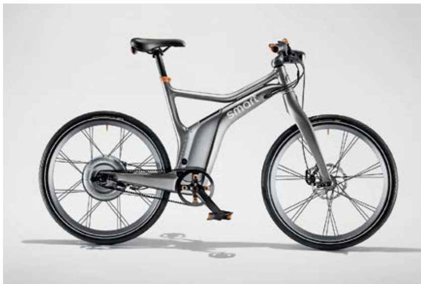
Matt grey/flame orange