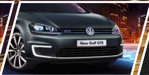
Carbon Grey 1K Metallic*