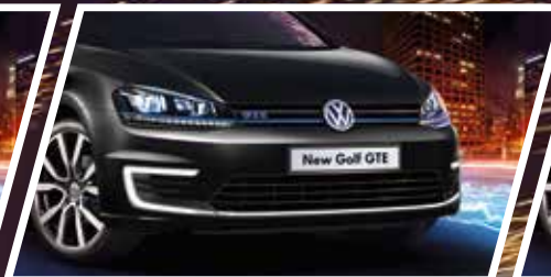
Black A1 Non-Metallic