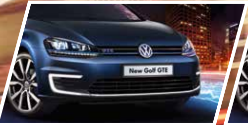
Night Blue Z2 Metallic*