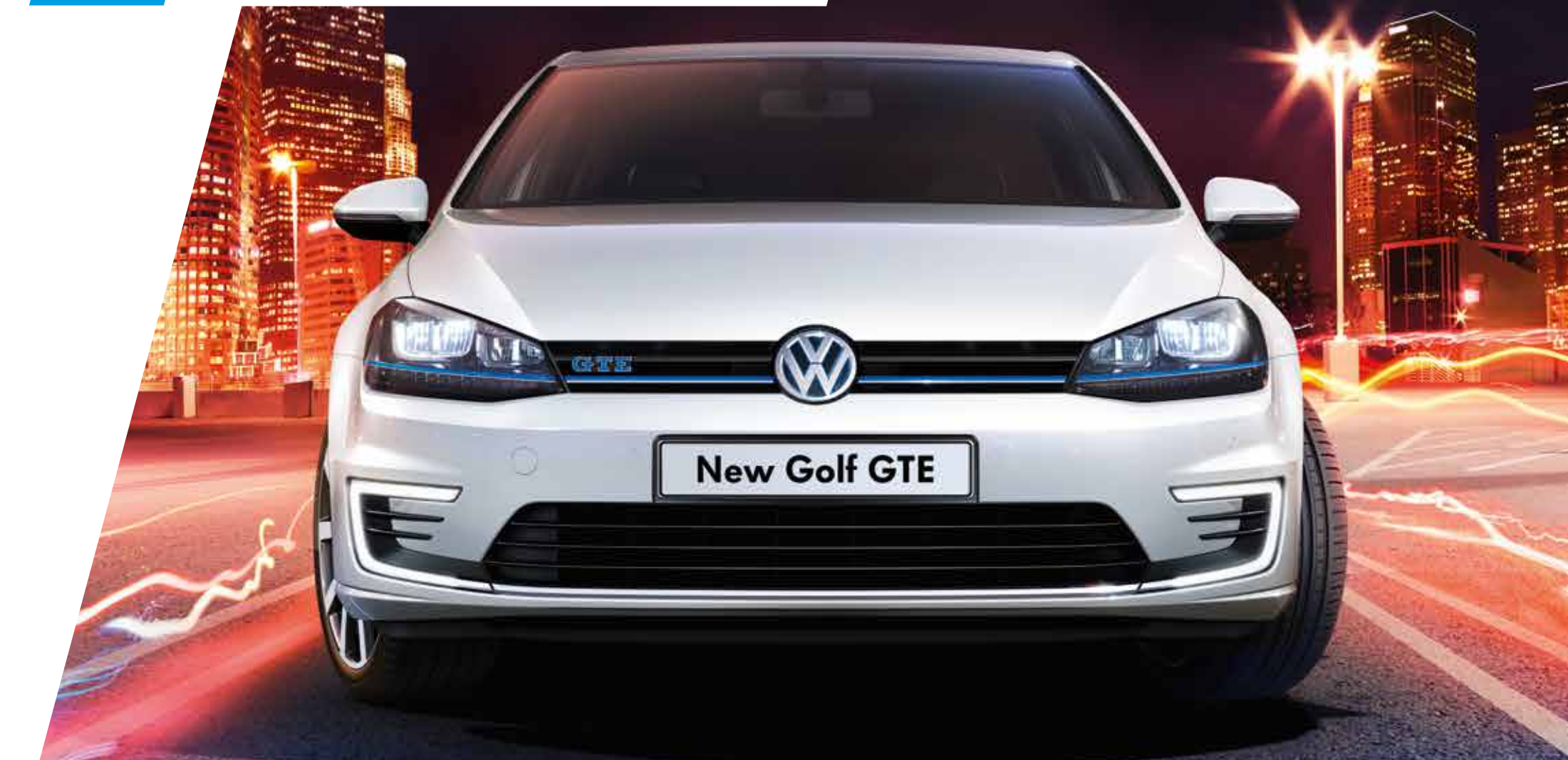
Model shown is new Golf GTE with optional premium paint.