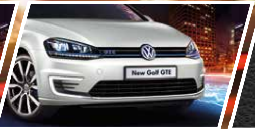
Oryx White OR Premium Paint*