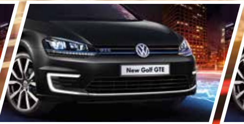
Deep Black 2T Pearl Effect*