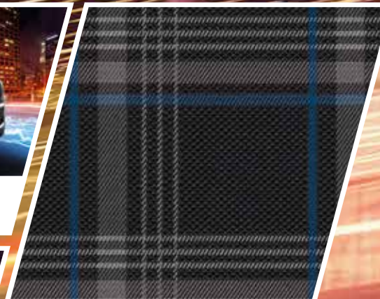
Standard 'Jacara Blue' cloth Titan Black/Blue TW