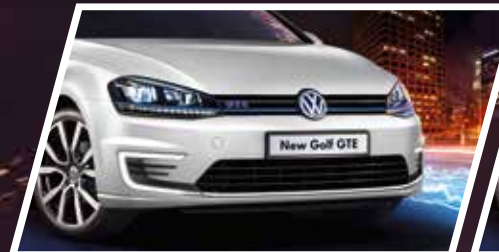
Pure White 0Q Non-Metallic*