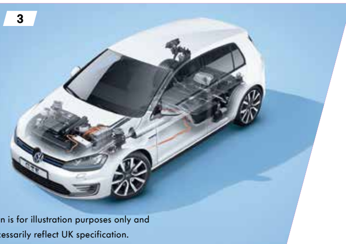
Image shown is for illustration purposes only and may not necessarily reflect UK specification.

The new Golf GTE represents a milestone in drive technology, combining a 1.4 litre TSI petrol engine with an electric motor to deliver breathtaking performance and unbelievable economy. Along with three hybrid driving modes and 'GTE' mode, it also offers the all-electric 'E-mode', ideal for urban driving, providing noiseless, emission-free operation in town or residential areas up to a distance of 31 miles. The different driving modes, energy flow and load condition of the lithium-ion battery are all displayed on the infotainment system, with kinetic energy normally lost during braking converted to electricity by regenerative braking and fed directly to the battery where it is stored.