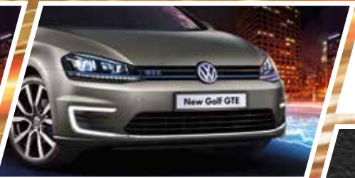
Limestone Grey Z1 Metallic*