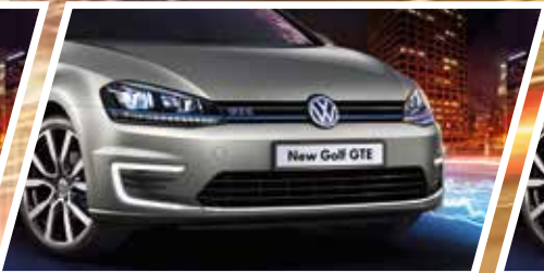
Tungsten Silver K5 Metallic*