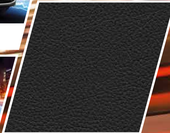
Optional 'Vienna' leather** Black TW