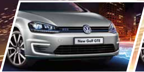
Reflex Silver 8E Metallic*