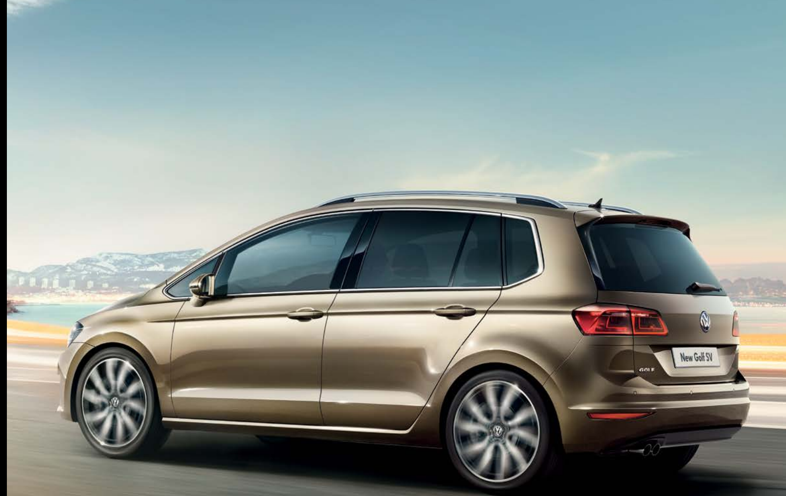
Model shown is new Golf SV GT with optional 18" 'Serron' alloy wheels, Bi-xenon headlights and metallic paint.