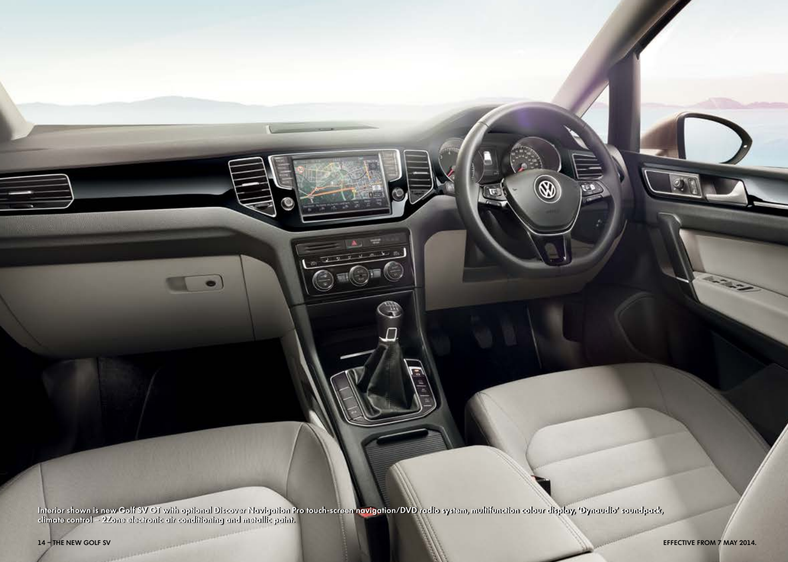
Interior shown is new Golf SV GT with optional Discover Navigation Pro touch-screen navigation/DVD radio system, multifunction colour display, 'Dynaudio' soundpack, climate control – 2Zone electronic air conditioning and metallic paint.