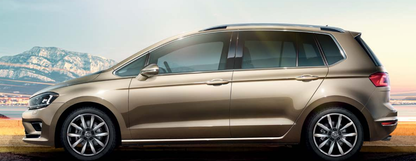
Model shown is new Golf SV GT with optional Bi-xenon headlights and metallic paint.