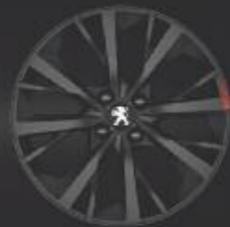
18" 'Lithium' Alloy Wheel**