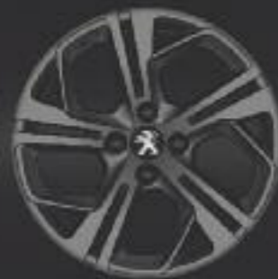
17" 'Carbone' Storm Grey Alloy Wheel*