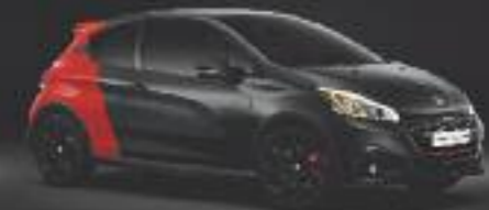
Matt Black / Red

*Unavailable on GTi by PEUGEOT SPORT **Available on GTi by PEUGEOT SPORT only